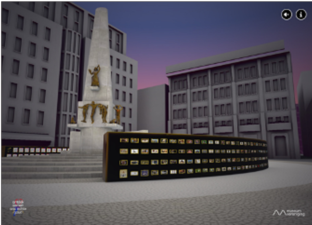
Figure 3 VR-experience of De Dam in Amsterdam with a wall including the interactive and digital programming of 400+ museums in the Netherlands.

artworks is the Instagram page Between Art and Quarantine (Tussen Kunst en Quarantaine) (Officier & Weger 2020). Here, inventors Anneloes Officier en Floor de Weger encourage visitors to dress up as their favorite artworks using 3 household items ( Figure 4 ).