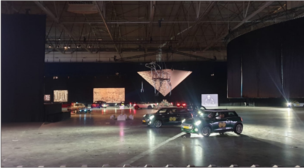
Figure 2 Museum Boijmans van Beuningen's 'Drive through' museum in Ahoy.