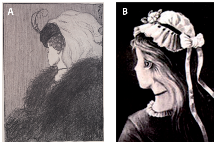
Figure 1. “My wife and my mother-in-law”

Perception can be defined in several ways, including i ) the ability to see, hear, or become aware of something through the senses and ii ) the way something is regarded, understood,