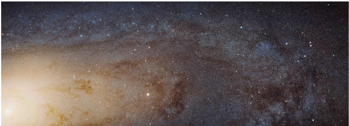
Fig. 6. American National Aeronautics and Space Administration, NASA, Andromeda Galaxy , (January 5th, 2015).