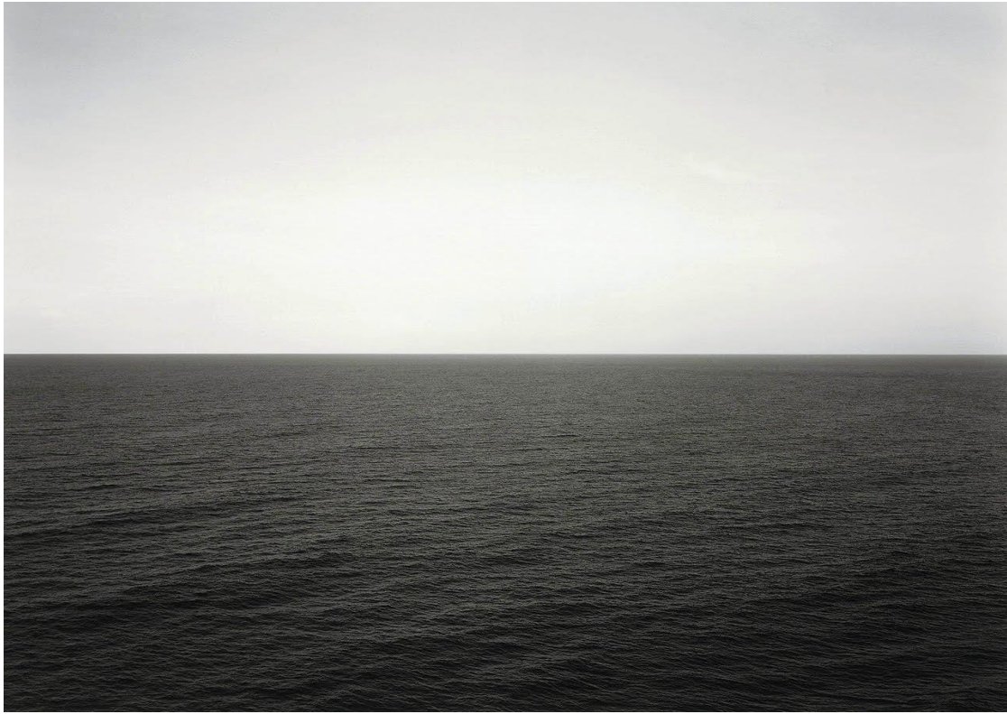
Fig. 9. Hiroshi Sugimoto, Caribbean Sea, Jamaica , (1980).