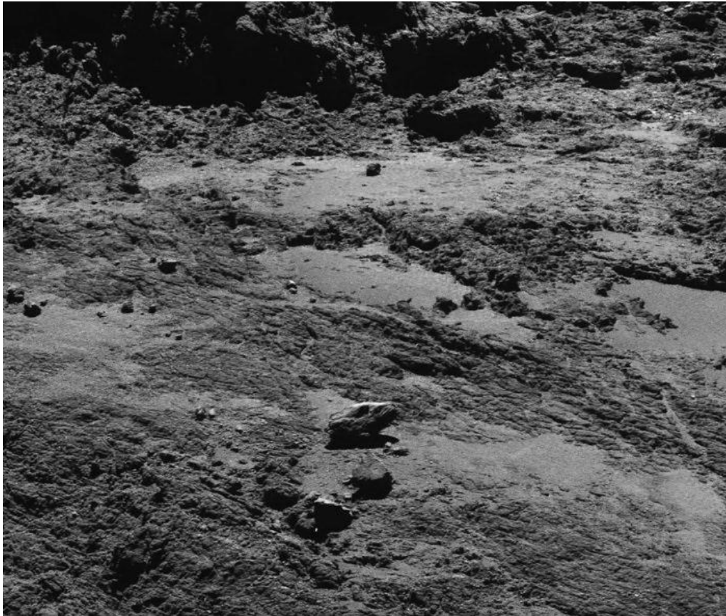
Fig. 5. European Space Agency, ESA, Untitled photograph. (July 3d, 2016).