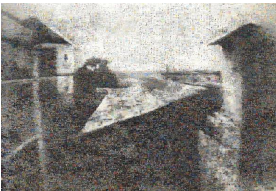
Fig. 4. Joan Fontcuberta, Googlegram: Niépce , (2005).