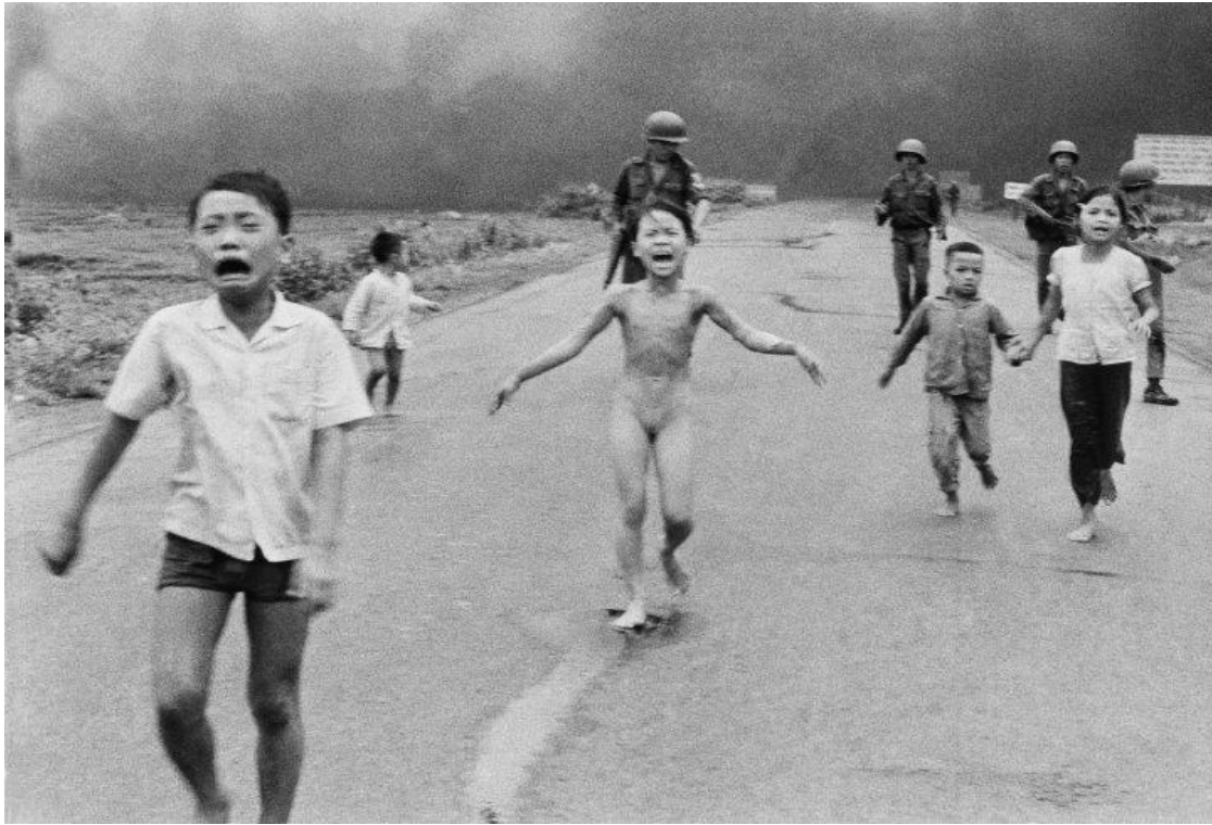
Fig. 7. Nick Ut, The Terror of War . (June 8th 1972)