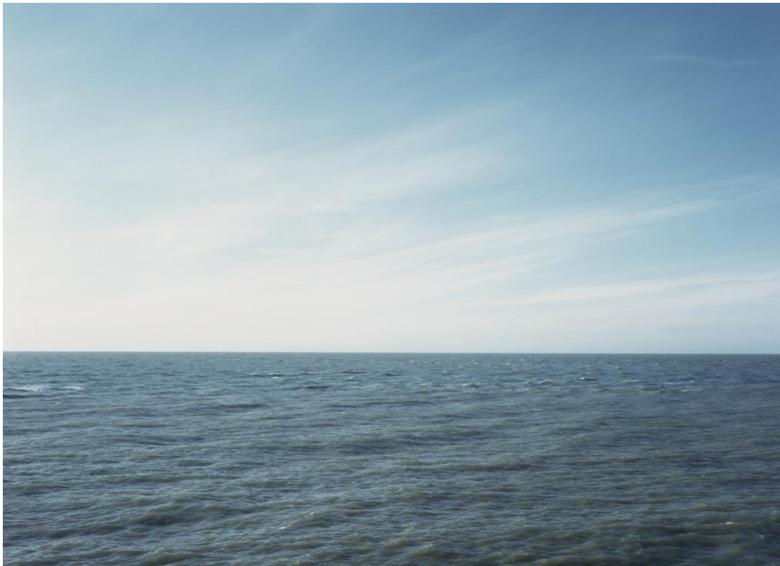
Fig. 8. Gert Jan Kocken, The Herald of Free Enterprise Capsizes Just Outside the Harbour of Zeebrugge Killing 192 People , (1999).