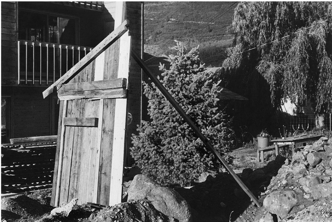
Fig. 2. Gary Metz, Untitled photograph from the collection Quaking Aspen: A Lyric Complaint , (Published in January 2012).