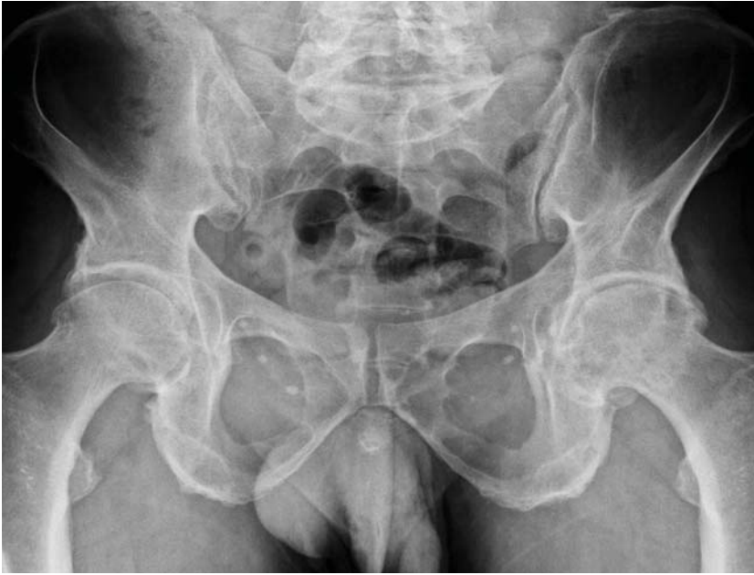
Figure 3. Most patients showed gross acetabular osteophytes but had wide joint spaces, indicative for retained or hypertrophied cartilage (right hip in this radiograph). A minority of patients showed joint space narrowing indicating cartilage loss accompanied by irregularity and sclerosis of subchondral bone (left hip in this radiograph).