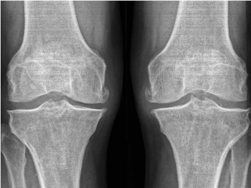
Figure 4. In acromegalic patients, unusually wide joint spaces were common, indicating thickened cartilage, both between the femorotibial and in the patellofemoral joint. The extremely wide joint spaces were combined with severe osteophytosis.