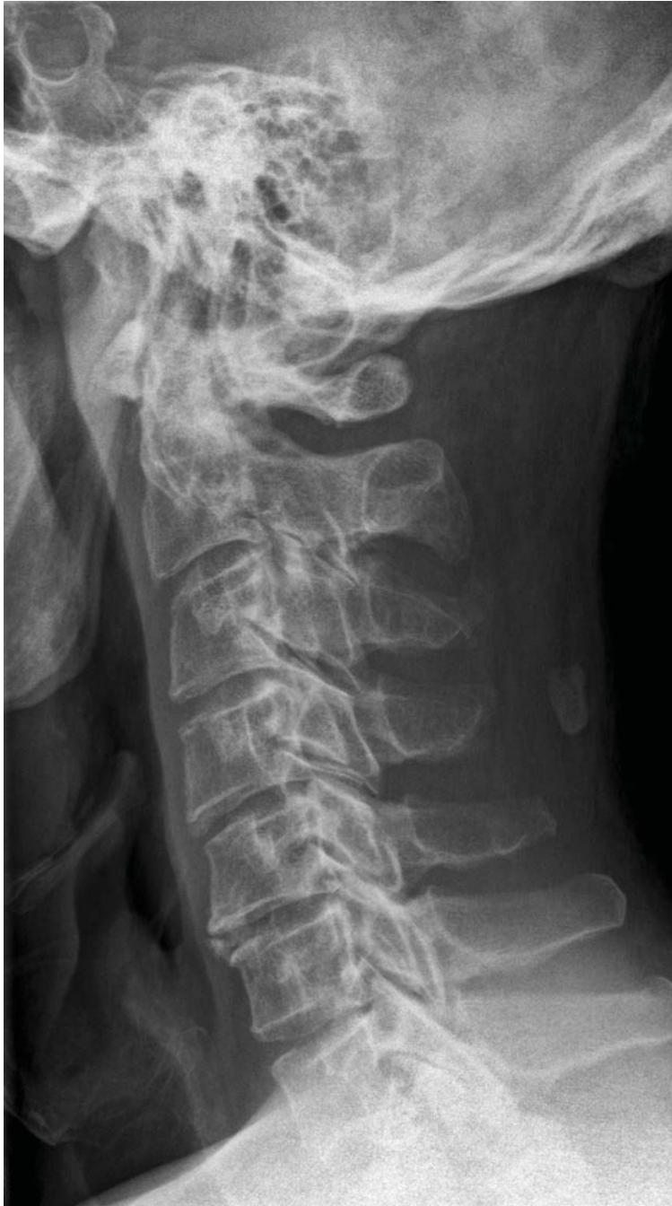
Figure 2. Radiological osteoarthritis of the spine was characterized by osteophytes at the anterior parts of the cervical and lumbar vertebrae which evenly affected the discs and the apophyseal joints. The lower vertebrae were more affected than the upper vertebrae. In this radiograph an enlargement of the Sella Turcica and gross osteophytosis in combination with intervertebral disc space narrowing is prominent. The discs are affected slightly more than the facet joints.