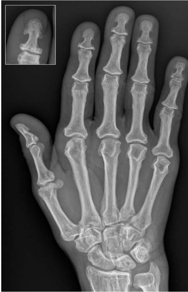
Figure 5. The main feature of osteoarthritis of the hands in acromegalic patients was the heavy tufting of the phalanges, with the terminal phalanges being spade-like in shape. Other features included degenerative changes in the metacarpophalangeal joints, such as subchondral sclerosis and osteophytosis with preservation of the joint space resulting from increased cartilage thickness. Thus, this appearance known from active acromegaly persists even during long-term follow-up.