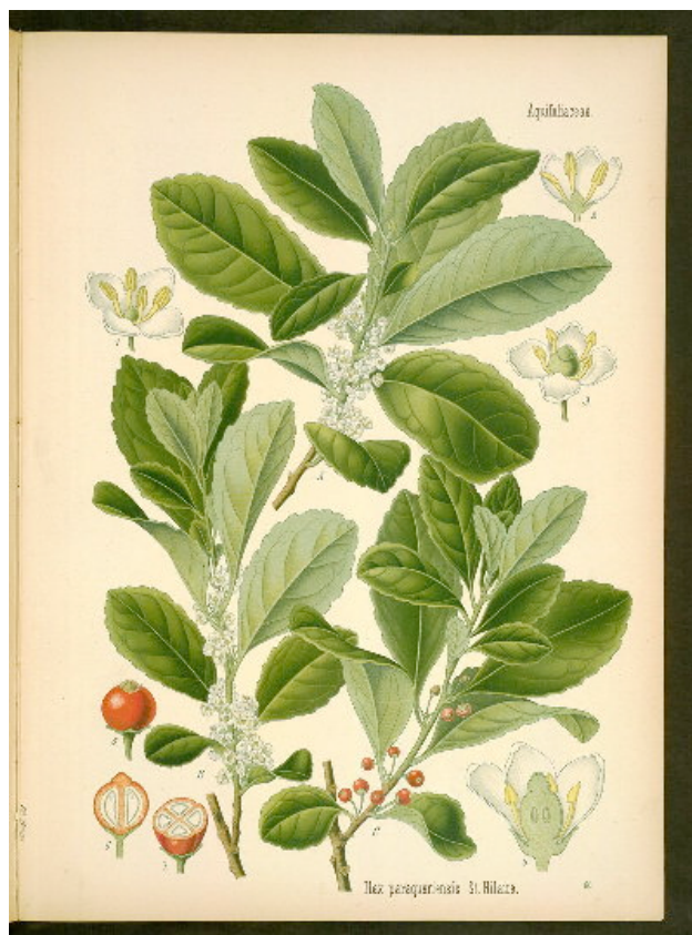
Fig. 6-5. Ilex paraguariensis var. paraguariensis - leaves, fruit and flowers

Ilex paraguariensis A. St-Hil. var. paraguariensis is a dioecious evergreen tree that grows to a height of up to 18 m (Fig. 6-5). Its leaves are alternate, coriaceous and obovate with a serrate margin and obtuse apex. The inflorescences are in corymboid fascicles, the male ones in a dichasium with three to 11 flowers, the female ones with one or three flowers. The flowers are small, and simple, number four or five and have a whitish corolla. The fruit is in a nucule; there are four or five single seed pyrenes (propagules) (Giberti, 1994).