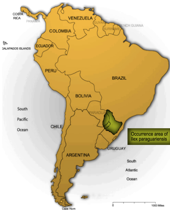
Fig. 6-2 Occurrence area of I. paraguariensis in S. America

Its consumption as a decoction, but more popularly as a sort of in-situ lixiviate has been documented right back to the very first occupation of S. American territories by Spanish colonizers and Jesuits in the northeastern zone of what is now Argentina, Paraguay and south of Brazil and even if its use by Guaraníes was banned at times due to its stimulant properties, its consumption steadily grew, spreading to all the south of S. America with the exception of Chile.