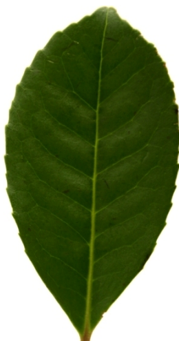
Fig. 6-1 Leaf of Ilex paraguariensis (Aquifoliaceae)

Yerba mate or mate is the roasted and dried leaf of Ilex paraguariensis A. St-Hil. var. paraguariensis (Aquifoliaceae), one of the 400 or more species of the Ilex genus.