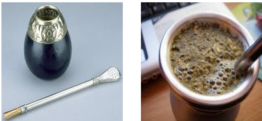
Fig. 6-3 Typical mate gourd and "bombilla" and commercial yerba mate.

Important world players in the beverage market such as Coca Cola have perceived the importance of yerba mate and launched a bottled drink in 2003 based on a mate extract, which was later discontinued due to a lack of commercial success. However, they are back again and have recently launched their own brand of yerba mate in Uruguay and in Argentina, with a production plant in Misiones, Argentina.