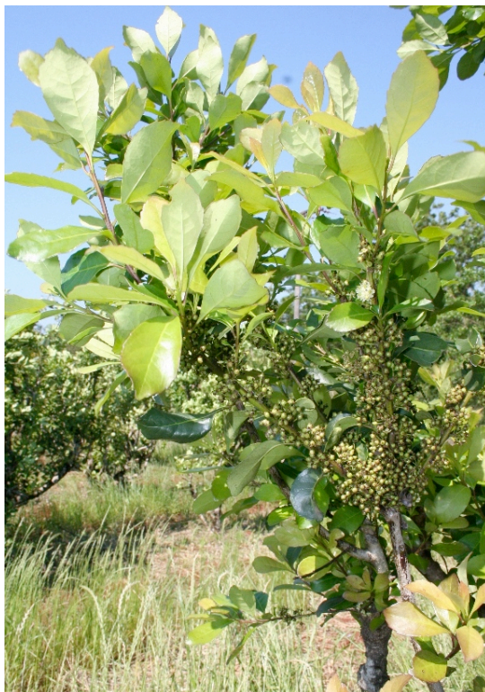
Fig 6.6 Ilex paraguariensis tree plantation (INYM- Argentina)

native to Paraguay, Argentina and Brazil, the producer of a bitter-tasting maté and supposedly cultivated in Misiones by the Jesuits to produce their famous "caá mini" maté; I. dumosa var. dumosa is also used. Ilex theezans C. Martius ex Reisseck (cauna de folhas largas, ca'a na, congonha), is a good substitute for I. paraguariensis , found in Paraguay, Argentina and Brazil. Ilex brevicuspis Reisseck, known as cauna or voadeira, produces low quality mate.