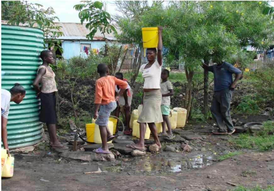
Photo 6 Women fetching water from a private kiosk in Shauri Yako (2011)

Fetching of water is mainly a female task (Photo 6). In the large majority of the households in Sofia and Shauri Yako, it was the female head or the female spouse or a female child who was normally responsible to fetch water (see Annex 1, Table A.4). In quite a number of households, fetching water was a shared responsibility of (at least) two persons; 38 again mostly women, although male children and sometimes the male head were also mentioned. Women and young girls carry a double burden of disadvantage, since they are the ones who sacrifice their time and their education to fetch water (UNDP 2006).