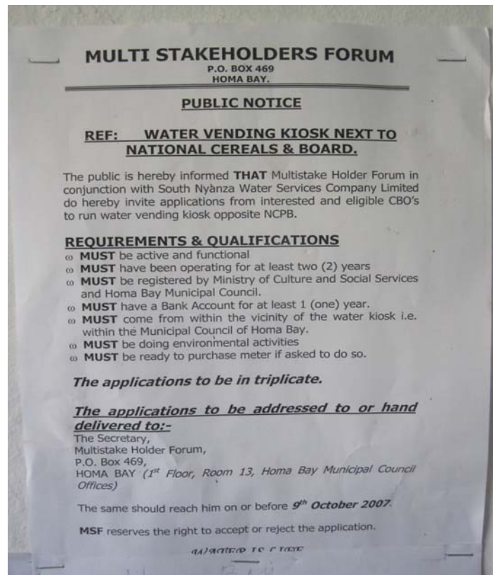
Photo 3 MSF notice for water vending kiosk

The selection of the groups to operate the kiosks is the responsibility of the MSF: with public announcements, groups can apply. To qualify, groups have to fulfil various requirements (Photo 3): they must be active and functional for at least two years, they must be registered by the Ministry of Culture and Social Services and by the Homa Bay Municipal Council, they must have a bank account for at least one year, they must come from within the vicinity of the water kiosk concerned, they must be engaged in environmental activities, and they must be ready to purchase a water meter if asked to do so.