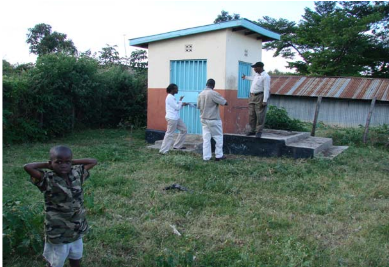
Photo 4 Koginga Beach water kiosk when it was non-operational (2008)