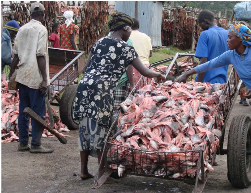
Photo 8 Traders with mgongo wazi from the fish-processing factory (2008)

the house who needed water, another three sold water, while one person brewed and sold a local brew called chang'aa 54 (see Table A.10, Annex 1).