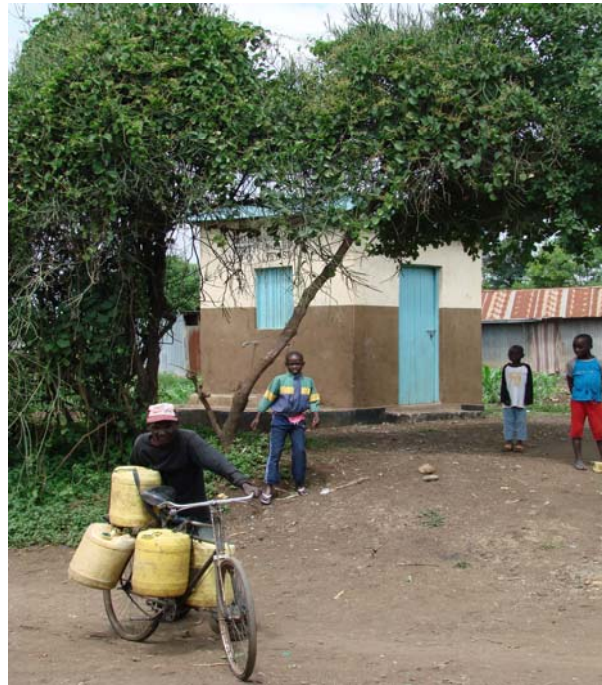
Photo 5 A vendor with water from a private kiosk further away passes near a non-operational LVWATSAN water kiosk in Sofia (2011)

municipal stadium and distribute it to their customers using hand carts or bicycles (Photo 5). The longer the distance from the water source, the higher the price the customers have to pay.