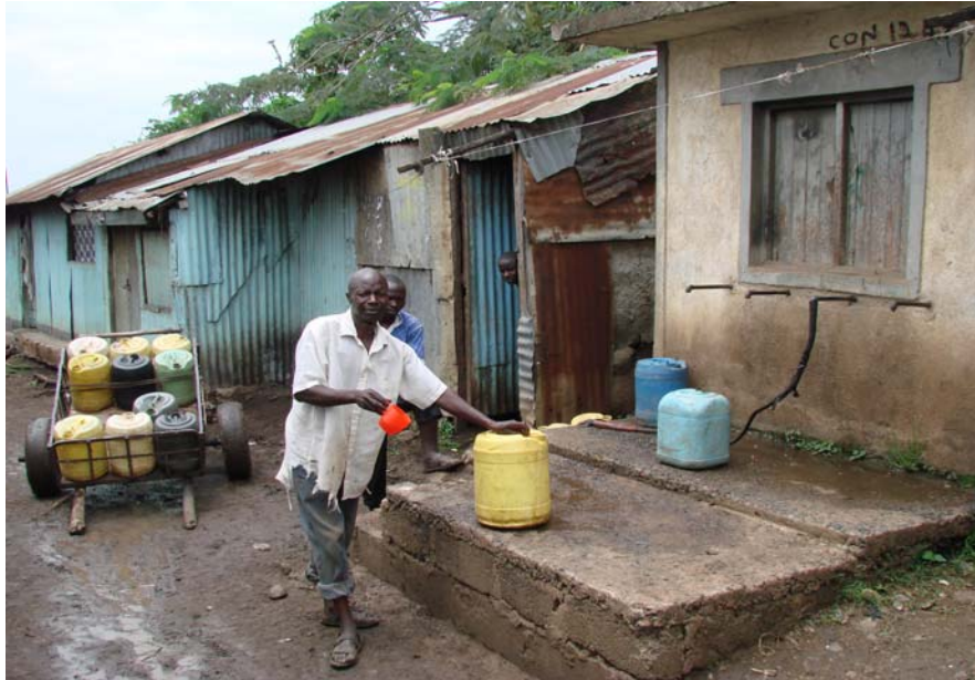
Photo 7 A water vendor gets water from a private water kiosk in Sofia (2011)

Moreover, households relying on private water vendors were just as much – if not more – faced with an unreliable, interrupted and insufficient water supply as people with access to piped water.