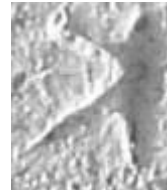
Image #3: <k> in ke °B-07