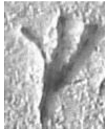
Image #2: <Ψ> in anivaΨeti °B-07