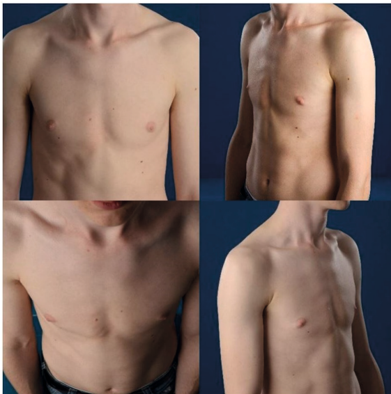
Figure 3 Example of four photographs of a patient after treatment