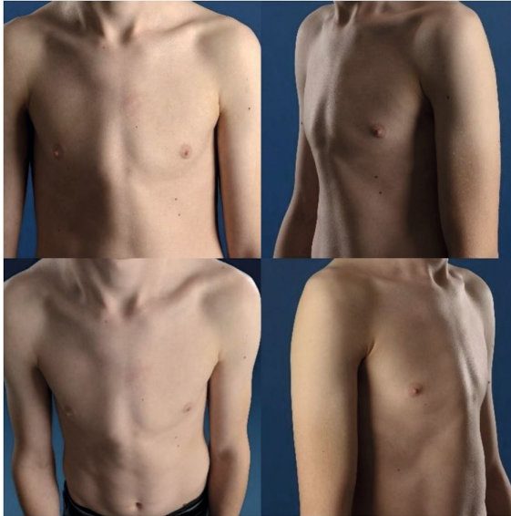
Figure 2 Example of four photographs of a patient before treatment