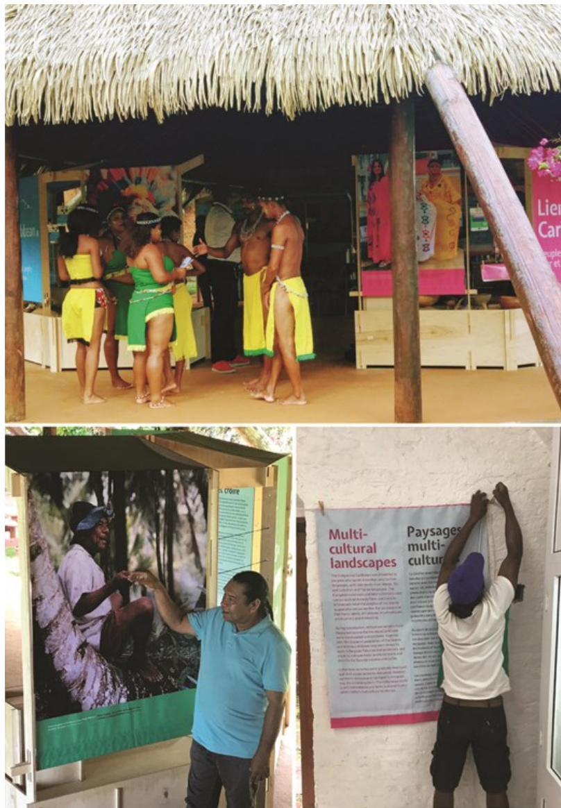
Figure 8. The opening of the Caribbean Ties exhibit in the Barana Autê, Kalinago Territory.