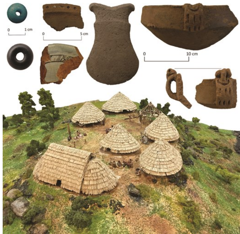
Figure 2. Model of the Argyle site with Cayo material culture and European finds, Argyle Saint Vincent (model by Eric Pelissier exhibited at the National Library at Kingstown).

peccary tooth pendants (Hofman et al. 2020a). On the other hand, some vessel shapes and decorative motifs also suggest affiliations with the Greater Antilles. Such affiliations would strengthen the hypotheses that Taíno refugees in the Lesser Antilles or Carib raids on Taíno settlements in Puerto Rico, Hispaniola, and Cuba during the late fifteenth and early sixteenth centuries were responsible for the transmission of so-called Chicoid and Meillacoid stylistic traits to the Lesser Antilles (Boomert 1986; Hofman et al. 2021a; Sued-Badillo 1978). The presence of early European (Portuguese, Spanish, Italian, French, Dutch) materials in Cayo material culture assemblages further suggests trade relationships between the Indigenous inhabitants of the Lesser Antilles and the Europeans in the first decades of contact (Hofman et al. 2014, 2019).