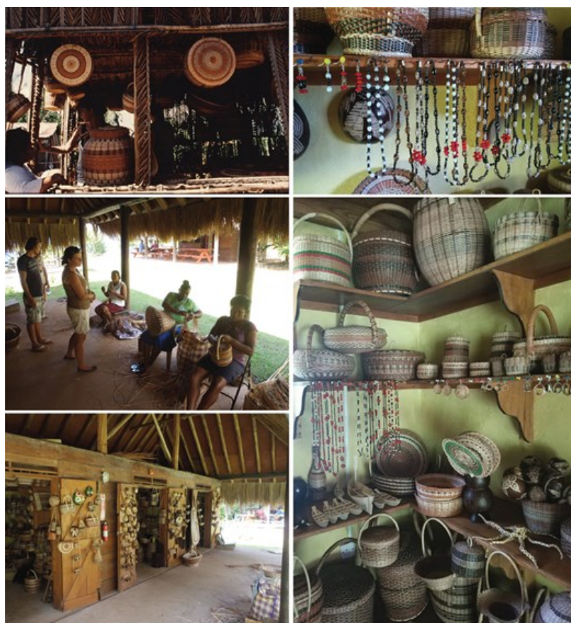
Figure 5. Traditional crafts at the Barana Autê, Kalinago Territory.

The Kalinago people use their skills and creativity to weave beautiful, valuable, and functional craft items out of larouma : baskets, caps, hats, sifters, squeezers, mats, and finger traps, which they sell to the tourists. Tourists can come to the Kalinago Territory to visit and meet the office of the chief in function; meet the traditional basket weavers (Figure 6), still weaving baskets; and witness canoe making, fishing on the rocks and other elements of the simple life that most individuals would live, growing their own food and preparing it in the traditional way. So, this is the actual message that has been carried on. It gives people a better appreciation of the culture, the way of life.