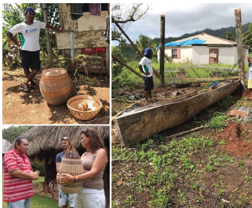
Figure 6. Traditional basketry and canoe making at Barana Autê.