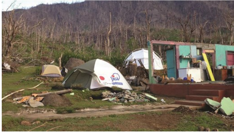
Figure 11. Impact of Hurricane Maria on the Kalinago Territory in September 2017 (Photo by Irvince Auguiste).

For the present-day Kalinago who are confronted with serious socioeconomic problems, these impactful phenomena bring not only changes to the environment on which they are mostly dependent, but also on their well-being and the traditional knowledge practices that form an integral part of their lives (Stancioff 2018).