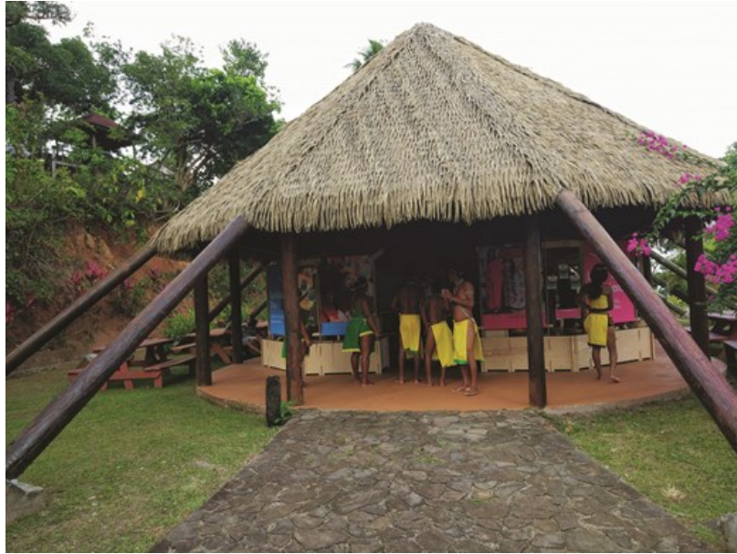
Figure 4. Thatched house in the Barana Autê, Kalinago Territory.

The village offers a unique experience, sharing the history and traditions of the Kalinago people from hundreds of years ago. The village also is intended to contribute to the socioeconomic development of the Kalinago of Dominica in several ways: by providing both direct and indirect economic gains to the residents of the community, and by creating greater awareness and appreciation of the Kalinago culture (Figure 5). The Kalinago Barana Autê consists of an interpretation center, snack bar, and gift shop. The village consists of a series of small huts ( ajoupas ) with the main karbet or taboui (biggest hut) in the center, where it is used for cultural and theatrical performances. The huts feature traditional activities such as canoe building, cassava processing, basket weaving, and calabash carving, as well as herb collection and preparation (Ariese 2019).