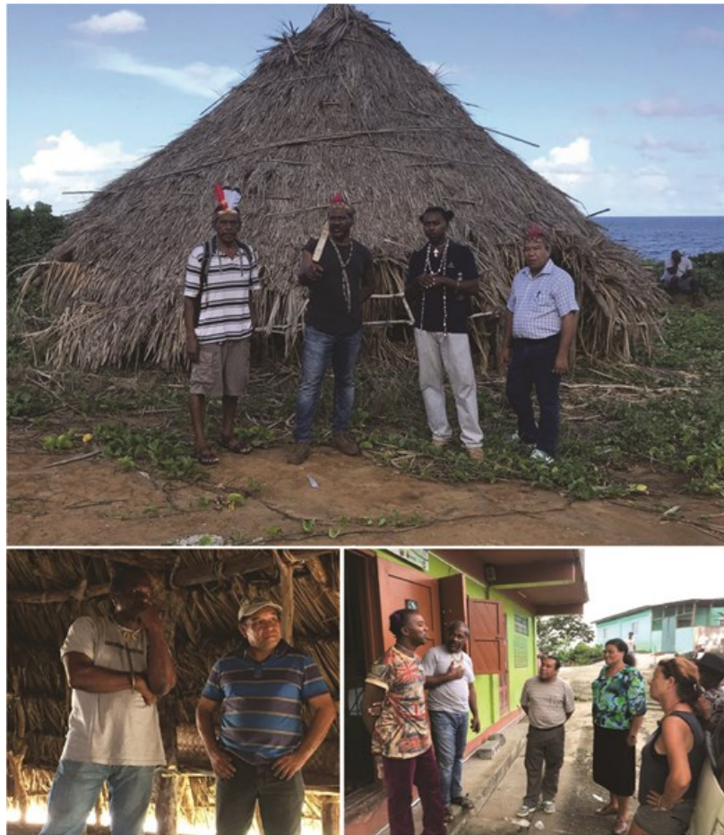
Figure 10. Consultation with Garifuna community leaders in Greiggs, Saint Vincent.