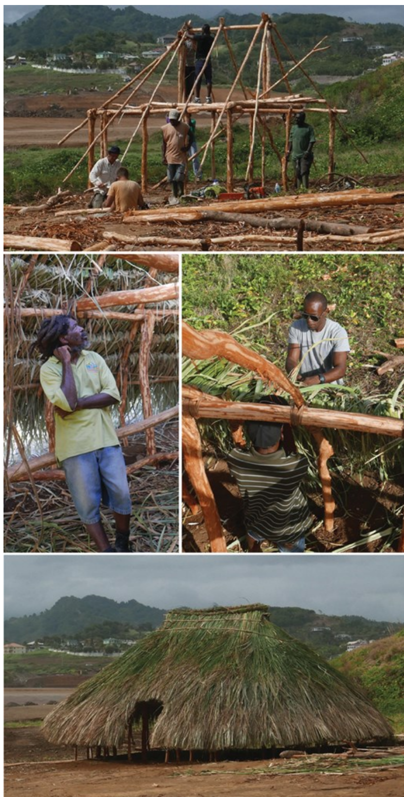
Figure 9. Building the táboüi at Argyle, St. Vincent.