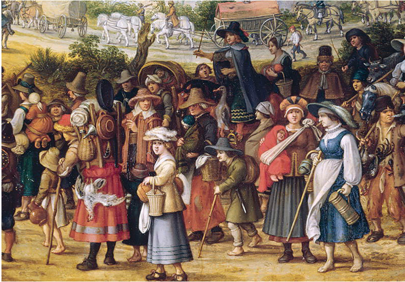
Illustration 2 People fleeing enemy advance during a war, painting by Sebastien Vrancx

conflicts which appeared there. 50 Applying the insights of the concept of the ‘uses of justice’ to the daily lives and interactions and conflicts of migrants with their neighbours and with the wider criminal justice system as a whole would allow us to further understand the many and various ways in which migrants could access forms of justice or have similar systems of social control used against them.