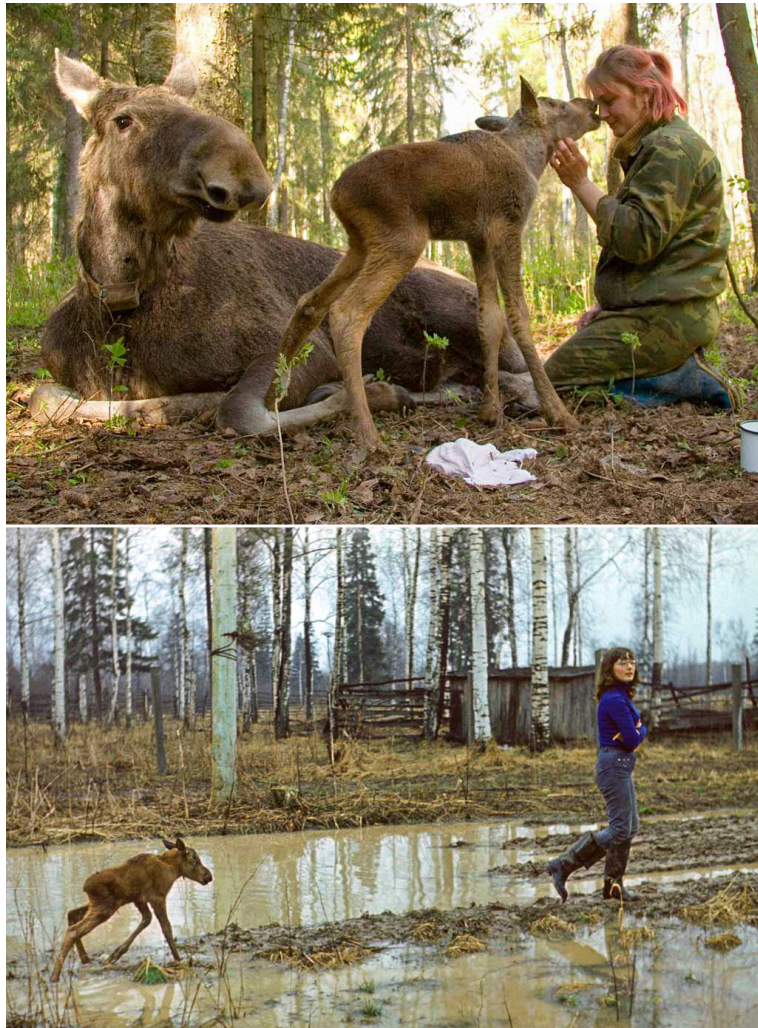
Figure 4. At the Sumarokovo Moose Farm (Russia) a calf is being replaced by a dairywoman a few hours after birth (top), after which the calf will bond with their new human mother (bottom) (Sumarokovo Moose Farm 2025).