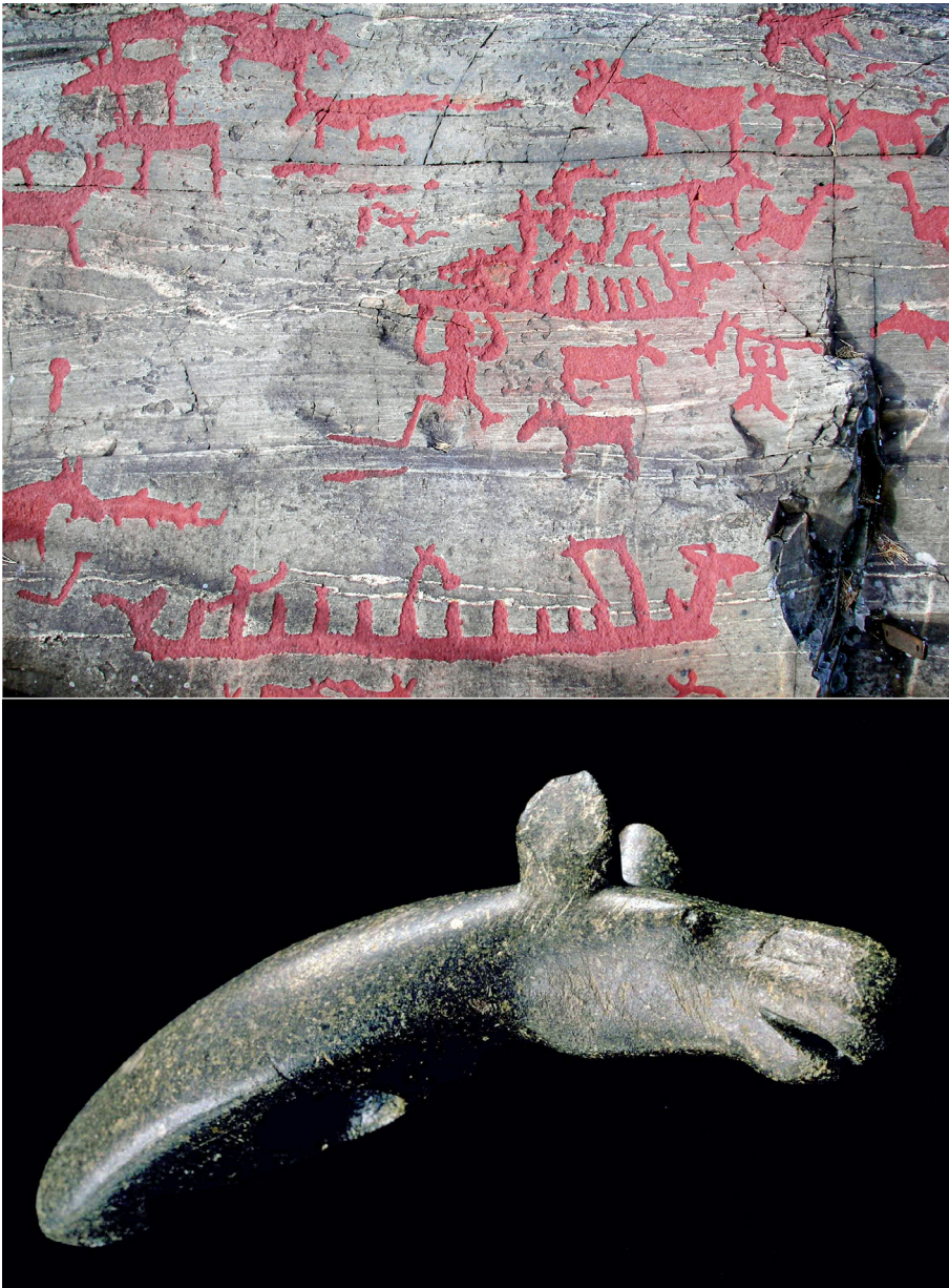
Figure 3. Swedish rock art depicting elk and boats with elk-headed prows and an elk-headed Neolithic stone axe from Sweden.

Despite their solitary and somewhat shy nature, elk are reasonably easy to tame, as evidenced by abundant historical and ethnographic accounts of tame elk and domestication experiments (e.g. Chisholm 2019; Sipko et al. 2019). Russian rock art, dating from the Stone Age to the Iron Age, provides prehistoric evidence of tame elk, depicting elk in harness-like contraptions and some even towing a person (Sipko et al. 2019).