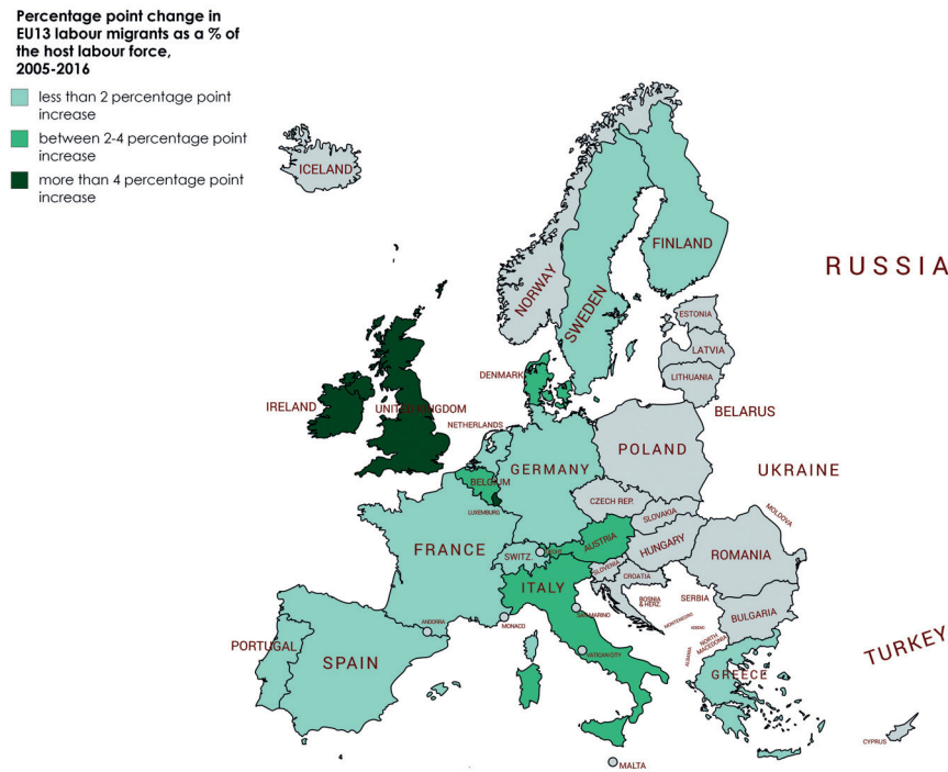
Figure 3.4: The percentage point change in Central and Eastern European (CEE) labour migration as a percentage of the labour force, from 2005-2016

Source: own elaboration based on EU-LFS data Note: countries displayed in a colour not included in the legend indicate no data available