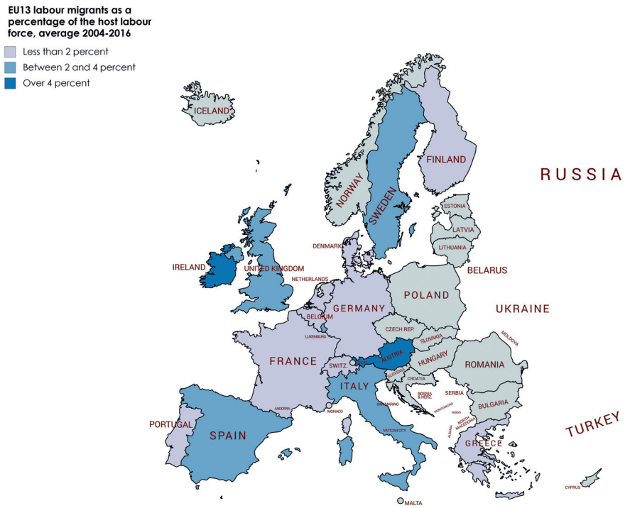
Figure 3.2: Central and Eastern European labour migration as a percentage of the labour force, average 2004-2016

Source: own elaboration based on EU-LFS data Note: countries displayed in a colour not included in the legend indicate no data available