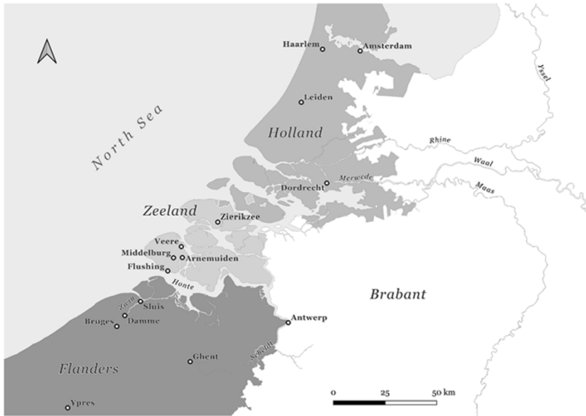
Figure 1. Map of the Low Countries in the fifteenth century.

Source: Created by Ward Leloup, based on Rombert Stapel, 'Historical atlas of the Low Countries (1350–1800)', https://hdl.handle.net/10622/pgfytm , IISH data collection, V14. Also see Rombout J. Stapel, 'Historical atlas of the Low Countries: a GIS dataset of locality-level boundaries (1350–1800)', Research Data Journal for the Humanities and Social Sciences 8 (1), 2023, 1–33.