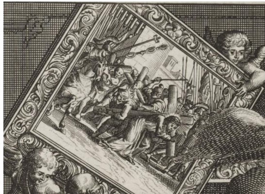
Figure 2: Detail of figure 1.

Included in each engraving are cherubs holding a picture frame, depicting a scene from the Passion of Christ. The attention of the dying man in his bed is often fully focused on the painting within the engraving. In other cases, such as in plate 26 (fig. 1), a parallel is drawn between Christ,