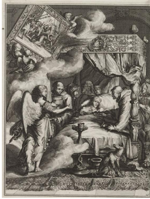
Figure 1: Romeyn de Hooghe, Spiegel om Wel te Sterven , plate 26, 1694, engraving, 186 x 146 mm. (The Hague, National Library, inv. no. KW 26 G 12.)

could imply that the textual sections are secondary to the images, or that the text was mainly for reading aloud to the dying person, who was physically unable to read himself. 21 To demonstrate the synergy between image and word, an analysis of the two engravings that depict the Thieves, along with their accompanying texts is presented here. The word-image interplay helped reader-viewers to be able to remember elusive and intangible concepts, making the Spiegel an ideal case study for exploring the didactic and devotional role of the Good Thief. 22