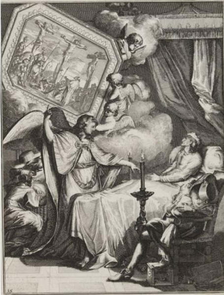
Figure 3: Romeyn de Hooghe, Spiegel om Wel te Sterven , plate 35, 1694, engraving, 186 x 146 mm. (The Hague, National Library of the Netherlands, inv. no. KW 26 G 12.)

the Thieves, and the dying man. The painting depicts the scene where Christ almost collapses under the weight of the cross on the road to Golgotha. Behind him are the Two Thieves carrying their own crosses—Dismas with his young, defeated face and Gestas on the left with a terrifying expression and a bald head resembling a skull. Mimicking the three men carrying their crosses on the road to Golgotha, the dying man is given his own cross to hold. The same goes for plate 25 (image is not included in this article),