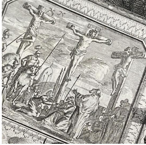
Figure 5: Detail of figure 3.

there, suspended from his hands, his legs seeking for support. The wood he is nailed on is of inferior quality: while Jesus and the Good Thief are crucified on nicely cut beams, Gestas is hung on unprocessed timber. Another telling indication that Gestas will go straight to hell is the pair of flying creatures that De Hooghe chose to depict, signifying his devilish soul departing from the body. 28 The materialization of the abstract idea of the unrepentant soul in these two beings is an important aspect of the iconographical scheme in the Spiegel . 29