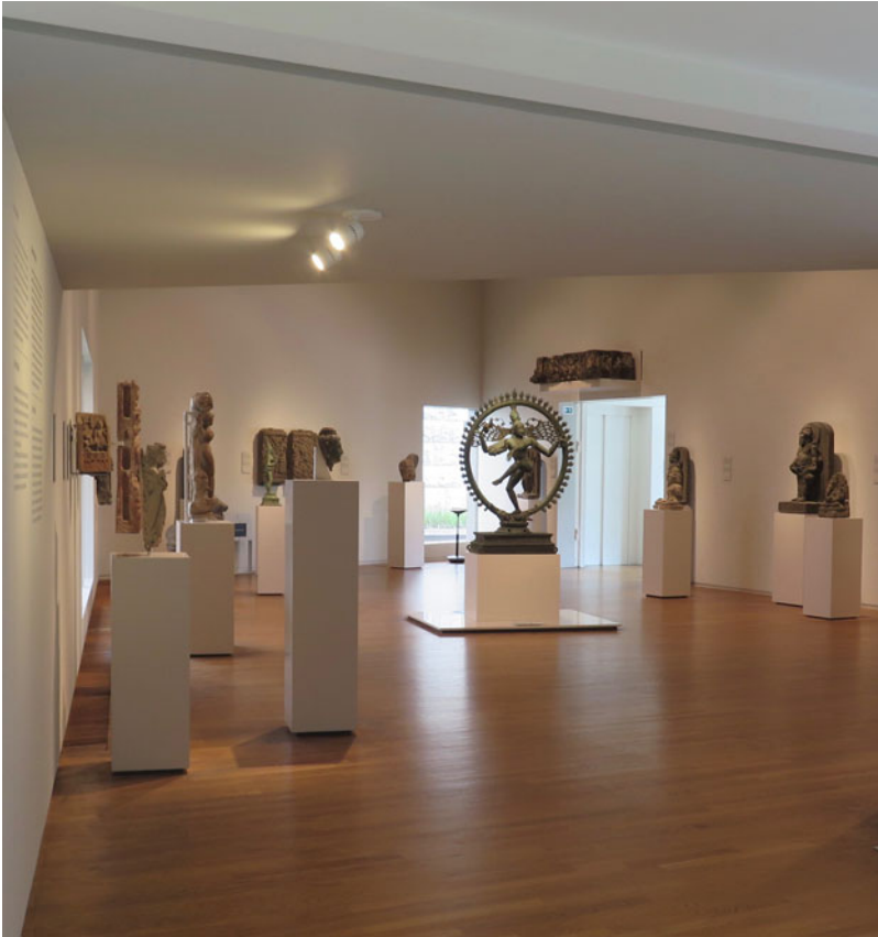
FIGURE 9. First room of the Asiatic pavilion of the Rijksmuseum, showing “a selection of arts from Asia,” starting here with South and Southeast Asia, then Pakistan and India (on the left) and Indonesia (on the right, and on the wall in the back). Most of the Rijksmuseum’s “arts from Asia” collection is on loan from the VVAK. Author’s photo, September 2020.

beauty but primarily ... to be an aid in bringing to life the deity represented, acting as intermediary between the worshipper and the invisible divinity.” 105 He thus suggested the possibility of spiritually connecting with this form of art through empathy.