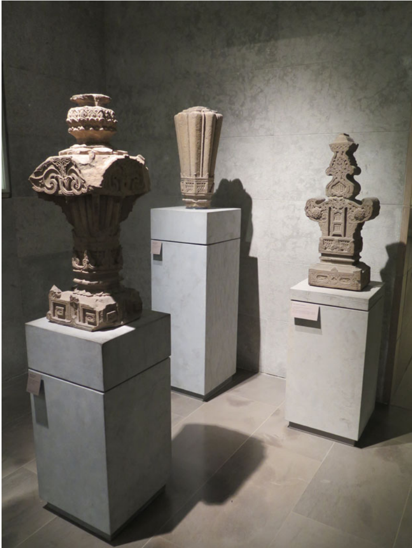
FIGURE 3. Stiles that Fauque sent to France, now on display at the Indonesian section of Musée Guimet. Author's photo, November 2017.

the category of ethnographic artifact to that of religious art. Since 1930, they have been held by the Museum of Asian Art in Paris, Musée Guimet. 37