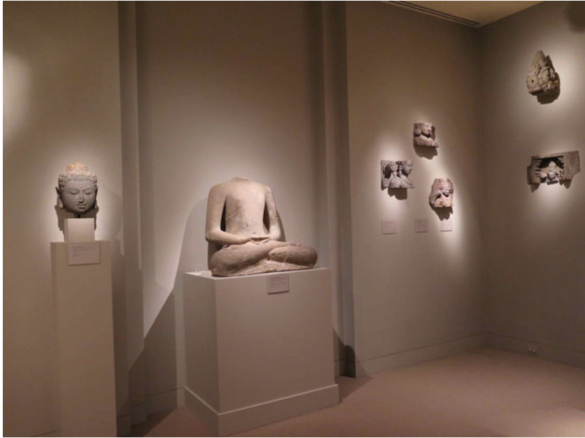
FIGURE 1. “Indonesia, Java,” part of the Southeast Asia section in the Metropolitan Museum. The first phrase of the introductory text is: “The roots of the classical tradition of Southeast Asian art lie in historical contacts with India.” Author’s photo, November 2014.

research and study in and on Asia, in “Asian art” collecting, exhibits and marketing, and the category of Asian art itself. The question is how and why such ideas developed in that field, and how it thereby became part and parcel of (epistemic) violence, structuring the way many people across the world think of Asia. From the Metropolitan Museum in New York to Musée Guimet in Paris and the Rijksmuseum in Amsterdam, well-choreographed exhibitions strategically use light and space to emphasize the spiritual power and inner beauty of Hindu and Buddhist statues, evoking ideas of Greater India (see Figs. 1, 5, and 8). In this way, they obfuscate the violence underlying how objects were collected and depict Southeast Asia as the passive recipient of a superior Indian civilization. 6