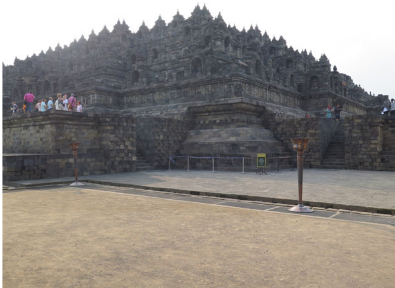
FIGURE 4. Borobudur, Central Java, Indonesia. Author's photo, May 2016.