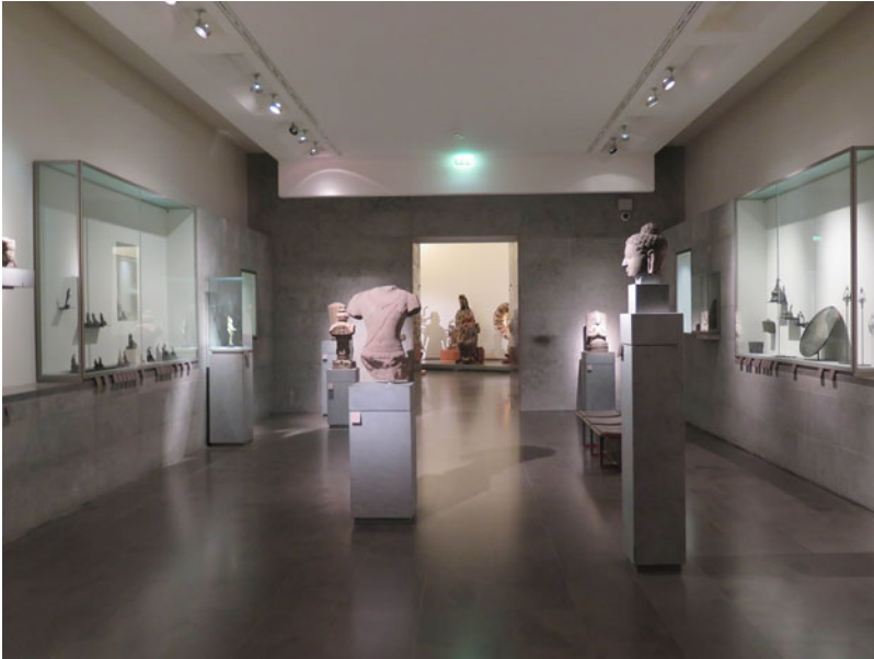
FIGURE 6. The Indonesian section, Musée Guimet. Got's Borobudur Buddha head is in the front, and the Islamic stiles from Aceh are visible in the back left corner. November 2017.

speak, not through the art displays in the museum, but through the sites of ancient Hindu-Buddhist temples and shrines in Asia that delivered objects for them. Such a site-centered imagination may explain the wave of criticism that followed the news that King Chulalongkorn, while in Java in 1896 on a diplomatic visit and Buddhist pilgrimage, had carried away “eight cartloads” of Javanese antiquities, notably also from Borobudur. These souvenirs from Java's Buddhist and Hindu temples, however, were gifted to the King, by the Netherlands-Indies government and by private colonial and Javanese elites, all thus presuming the role of owner. 60 Yet, such gifts, by that time, raised awareness of a market that encouraged such site-destructive actions. As early as 1899, the Dutch colonial newspaper Bataviaasch Nieuwsblad had reported that it was common for tourists to cut parts of “one statue or another” from Borobudur and that Javanese did so as well to sell them to tourists. 61 This awareness legitimated the colonial state's push to centralize heritage politics. Within this context of growing public and official concern about the deteriorating state of Borobudur, in 1913 the Netherlands Indies