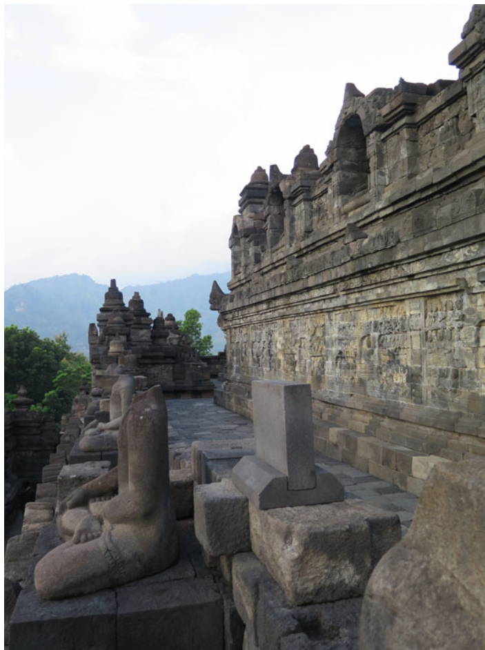
FIGURE 5. Headless Buddha statues at Borobudur. Author's photo, May 2016.

an object), the one who gives or takes presumes ownership, generating complex relationships of interdependency. 52