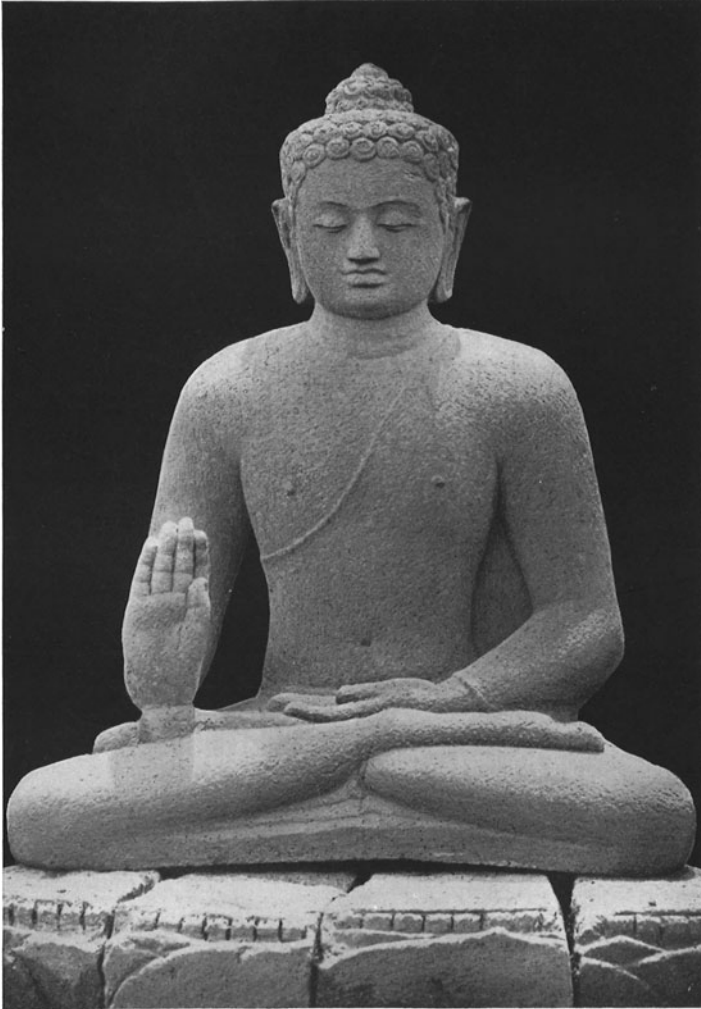
A DHYĀNI BUDDHA (From Bōrōbudūr, Java)

FIGURE 8. “One of the great artistic inspirations of the world.” The disputed Buddha Statue from Borobudur, Photographer unnamed. Published in Havell 1908: 28.