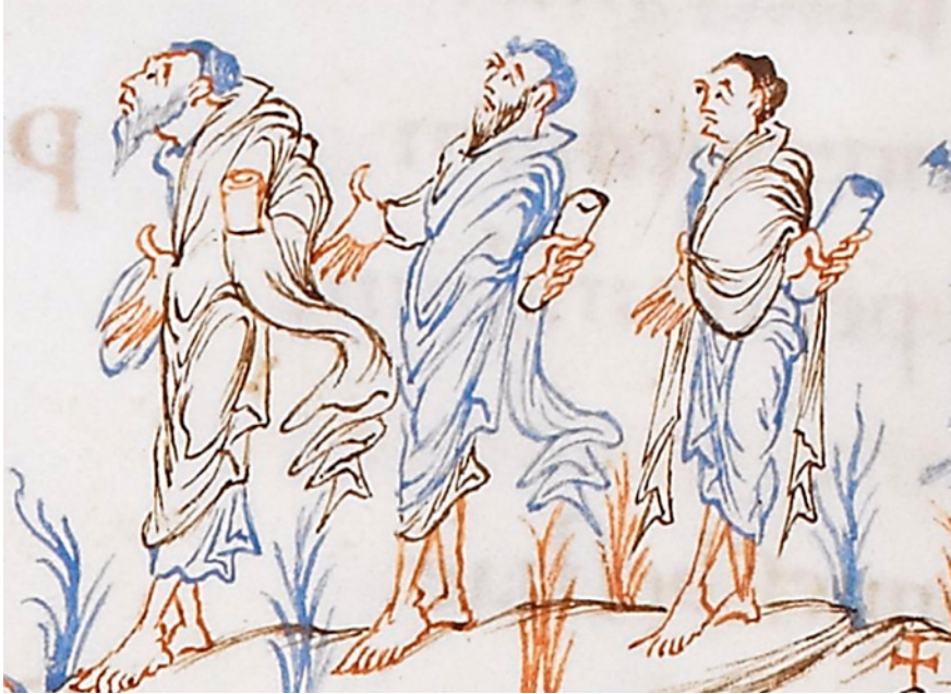
FIGURE 1.1 The three Patriarchs as the three ages of man. London, British Library, Harley 603, fol. 52v