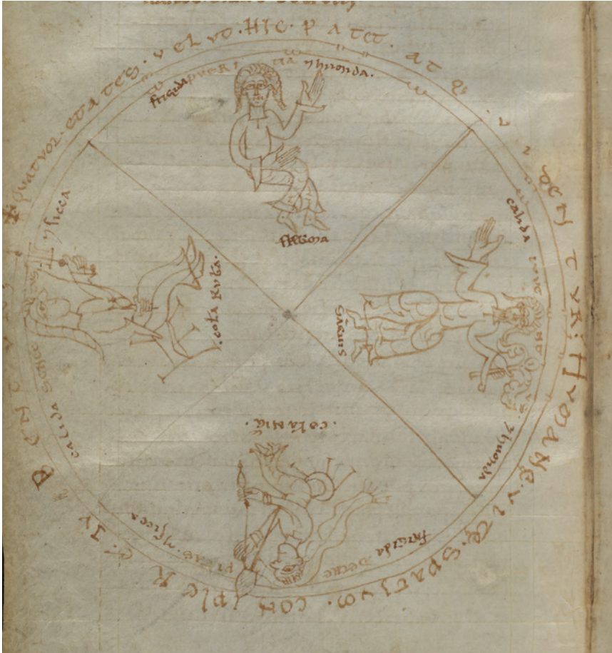
FIGURE 1.3 Diagram of the ages of woman in Cambridge, Gonville and Caius College, MS 428/428, fol. 28v

BY PERMISSION OF THE MASTER AND FELLOWS OF GONVILLE AND CAIUS COLLEGE, CAMBRIDGE