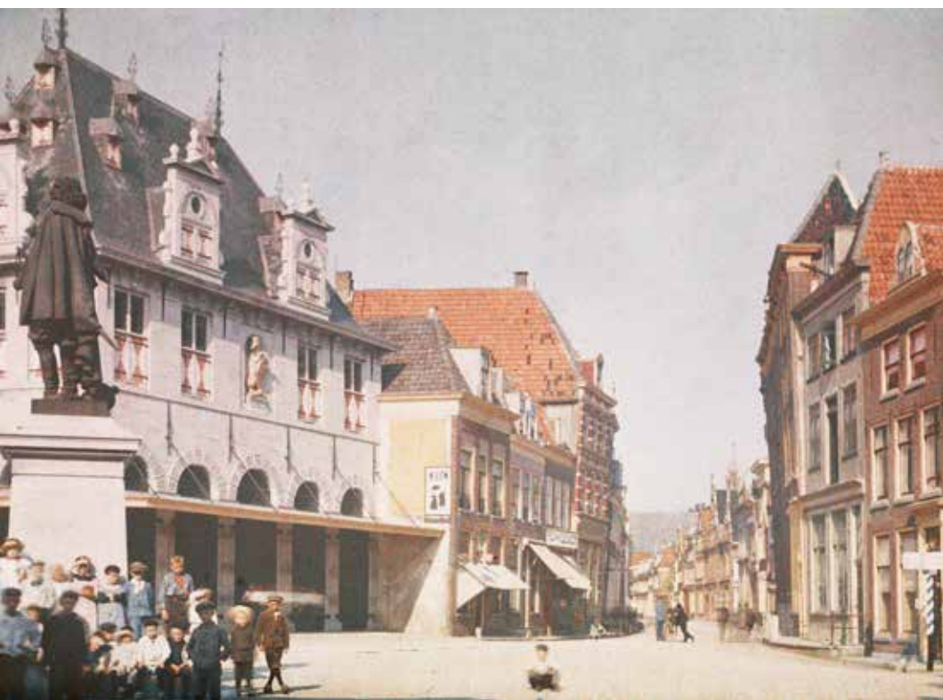
Statue of Jan Pieterszoon Coen in Hoorn with school children in front of it. Photograph from the beginning of the twentieth century. Rijksmuseum Amsterdam, RP-F-2005-47.

Unlike Germany, the process of ‘working through’ the past got off to a relatively slow start in the Netherlands – not gathering real momentum until the last decade. Until recently, the prevailing nostalgic tempo doeloe (‘times of yesteryear’) perception was that the Netherlands, as a ‘humane’ coloniser, had done much that was good for the Indies/Indonesia, including the founding of schools and hospitals, and the construction of roads. The work of the Dutch writer and scholar Rob Nieuwenhuys (1908-1999) is illustrative of this nostalgic cultural memory. Whilst acknowledging its dark sides, it does, however, still offer a romanticised view of the old Indies. Nieuwenhuys accepted that the Netherlands had lost the colony at the same time he felt nostalgic about his youth there, and thus he allowed himself to be moved by stories and photographs from tempo doeloe . 6 For those who knew the Indies from personal experience, its loss often gave rise to such nostalgia. In 2018, the Dutch writer Kester Freriks, who was born in Jakarta