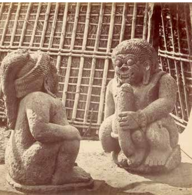
Hindu-Javanese statues in Gaprang near Kediri. Leiden University Libraries, KITLV 87758.

as they were in many Eurocentric texts. 79 Purwalelana in particular studies the ‘common people’, travels to villages, and visits their homes. It is also striking that in their texts the noblemen re-claim their own culture – one marginalised by the Dutch. One of their implicit strategies in this respect is to consistently emphasise that the places that the Dutch have renamed were originally called by a different name. Where the Dutch say Buitenzorg, they use the old name Bogor. Of King’s Square in Batavia, Purwalelana remarks that the indigenous inhabitants speak of Gambir square, whilst the old town Jakarta is ‘now called Batavia’. During his stay in Batavia, he notes that, as a result of the colonisation, there are ‘almost no true descendants of the original people of Batavia’: ‘Everything has been mixed up.’ 80 It is almost impossible to read this observation other than as a subtle reproach to the Dutch oppressor.