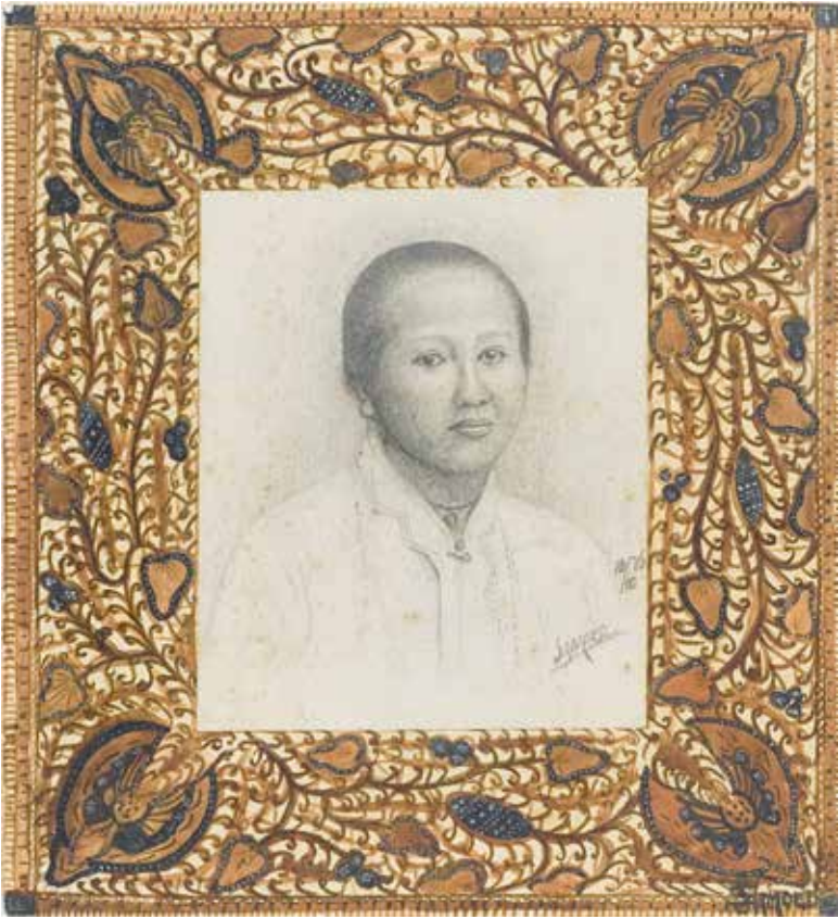
Portrait of Kartini, drawn from a photograph by 'Samoed', 1916.

Apparently, even in 1996, the time was not yet right for the suggestion, as a third option, that indigenous sources or texts (whether or not of a literary nature) could be researched. 17 This obviously requires learning the original languages as, without a command of these, one needs to resort to translations. Indonesians have always written, regardless of Dutch censorship. A manuscript culture existed until well into the nineteenth century. There was no Western censorship on texts, literary or otherwise, that circulated in handwritten copies. It was not until the end of that century that separate Indonesian texts appeared in print, but these were not subject to Western censorship either. It was only post-1917 that the director of the Committee for Popular Literature kept a watchful eye on the indigenous press. Previously, the Dutch Arabic and Islamic scholar Christiaan Snouck Hurgronje would monitor what was being written on behalf of the government, albeit always