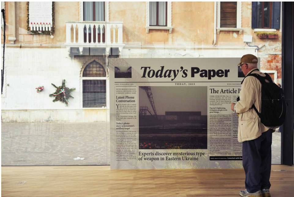
Figure 6. The Hope! exhibition at the Venice Biennale.

In the introductory note to her book Lucky Breaks (2018), Belorusets explains that she is interested in the ability of stories and photographs to '[escape] the author's final control over the materiality of past events, encounters, conversations, histories.' (2018, 7) Lucky Breaks consists of a series of fictionalized tales of women living in or having fled the war zone in Eastern Ukraine. The particular mix of real-life stories of women living in the shadows of the conflict with fiction and photography, Belorusets argues, should induce a clash between different voices, contexts, and artistic media, and result in a 'rejection of any instruments of certainty,' including the author's own role in the narrative. (2018, 8)