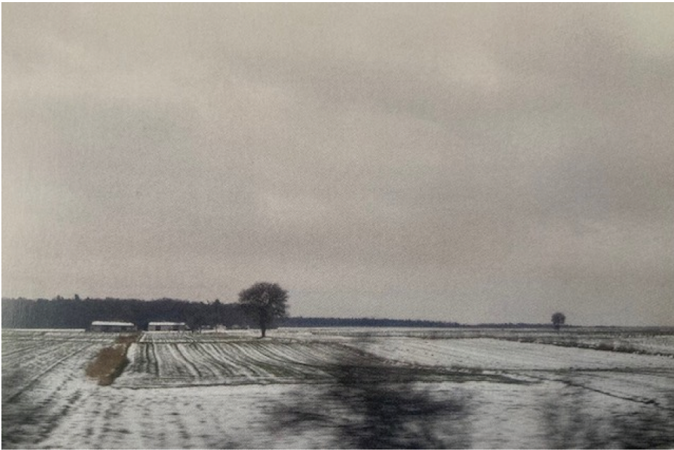
Figure 7. Photograph from a train window.

is accompanied by a slightly blurred photograph of a landscape taken from a train moving from Kyiv to Warsaw (Figure 7): ‘At some point along the way, I forced myself to take a picture of the landscape through the dusty train car window so that I wouldn’t forget what I was going through at that very moment. But it was in vain. All these experiences and memories seem impossible to contain.’ (2022a, 409)