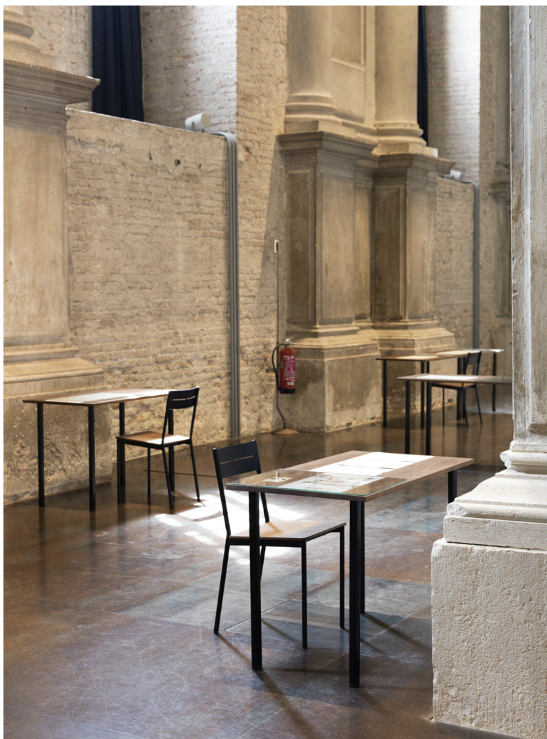
Figure 2. The Wartime Diary installation at the Venice Biennale.

a metal table with the text of a diary entry (Day 13, March 8) engraved in its rusted surfaces (Figure 4). The table was produced in the Kharkiv region and transported to Brussels by a vehicle carrying the possessions of refugees. Rusted iron, Belorusets explains, represents the qualities of collective memory which will remember the major events of the war, while the ‘minor’ acts of the everyday risk being ‘forgotten’: