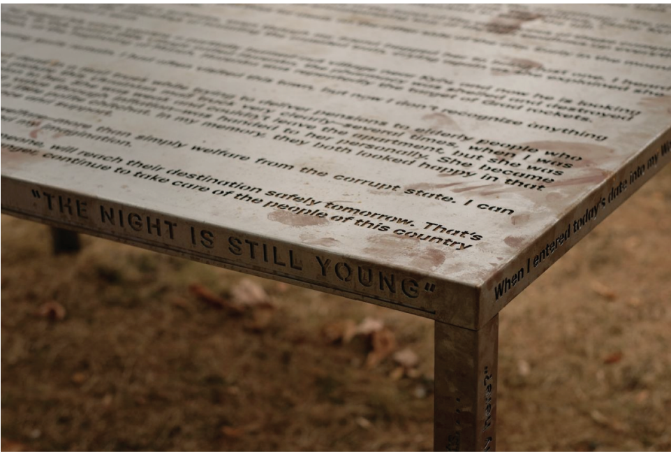
Figure 4. The installation One Day More at the European parliament in Brussels.

The metaphor of vulnerability that interconnects the surface of the table, memories of daily life during war, and strategies of everyday resistance also recalls images of ruins in Ukrainian cities caused by the Russian army. However, instead of shocking media images, this installation, like Beloruset's other diary works, creates a space of mourning and conversation which everyone around the table can join. Placed on the premises of the