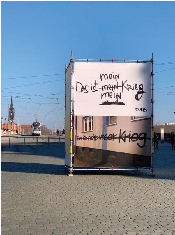
Figure 8. The installation Das ist mein Krieg in Dresden.

being external to Europe, either praising it as a heroic example for Europeans or referring to it as an apocalyptic sign of the future. Instead, her works address individuals and ‘implicate’ them into the experiences of the war by facilitating the possibility of personal associations without implying undifferentiated collectivity, neither within Ukraine nor connecting an imaginary ‘Ukraine’ and ‘Europe.’ Our readings of Beloruset’s texts, photographs, installations, and the links between them, demonstrated how the chronotope of immediacy (what we called ‘zoomed-in time/interlinked places’) creates a sense of connectedness while stressing the differential positionality of the author in relation to her interlocutors, as well as between their perspectives and external readers/viewers. By preserving everyday memories of the war, while simultaneously laying bare the ethical constraints and subjective decisions that inform such a ‘memory map,’ these works refuse the fear-based logic that dominates news reporting on the war.