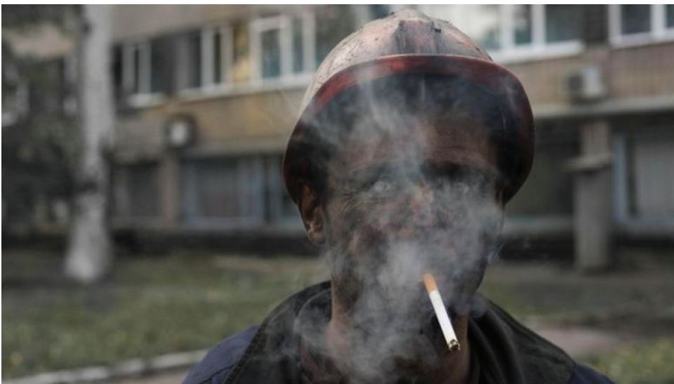
Figure 5. Photograph from the Victories of the Defeated series.

The photograph accompanying the recounted dialogue depicts a close-up of a miner's soot-covered face, his pale blue eyes peering through a cloud of cigarette smoke (Figure 5). To shoot with a camera, or with a gun: as journalist and writer Katja Petrowskaja points out in her reading of the image, the coal miner's remark invokes the