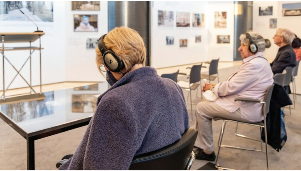
Figure 3. The Nebenan exhibition at the Bundestag.