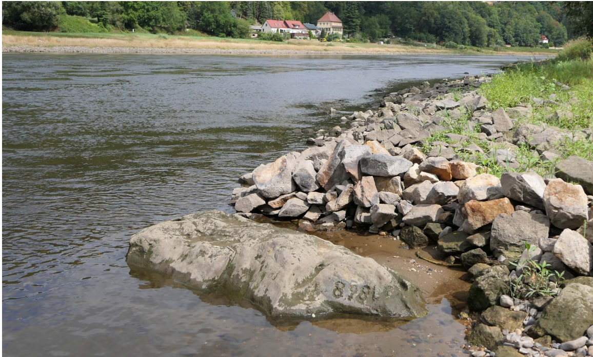
^ Fig. 3 The Wehlener Hungerstein, City of Wehlen, Germany (Source: Dr. Bernd Gross, CC BY 3.0, via Wikimedia Commons).