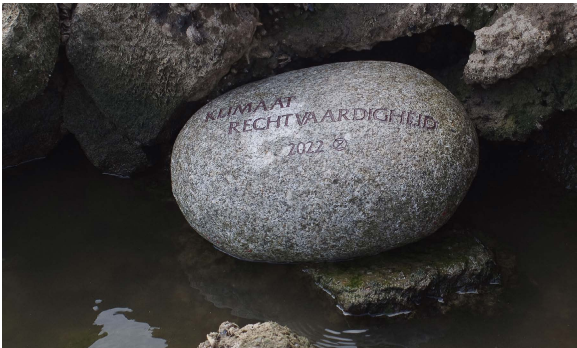
^ Fig. 4 Hunger stone placed by Extinction Rebellion in the river Rhine at Lexkesveer, Wageningen, the Netherlands (Source: Extinction Rebellion, CC BY 4.0, via Wikimedia Commons).