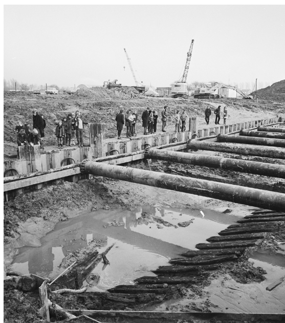
^ Fig. 6 A Roman shipwreck found in a former riverbed in Zwammerdam, the Netherlands.