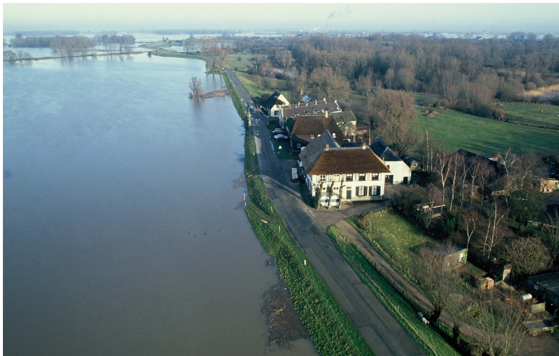
^ Fig. 7 High water at Ooijpolder at Tiengeboden, the river Waal, the Netherlands.

nation, let alone in relation to what is needed by the natural environment. Whole areas are transforming from swamps to arid areas and from arid areas to deserts. This lack of cooperation and the devastating results can be observed in the Donau-Black Sea Region, where unique swamps are under severe threats due to a lack of water, misuse of water and pollution. Pumping up water, lowering groundwater tables, sea-level rise and extreme drought also cause salinization, mainly in coastal areas. Land becomes unsuitable for agriculture, even as grazing land. We are starting to see these effects in the Netherlands, especially in the lower western parts of the country. What can we do about these problems? Can we only adapt to the changing situations? Or can we also do something to stop them from happening? And how does this relate to maritime and under-