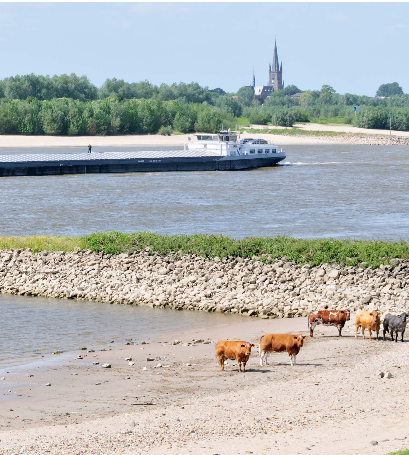
^ Fig. 2 Low water levels in the river Waal in the east of the Netherlands (Source: Martin van Lokven / Rijkswaterstaat).