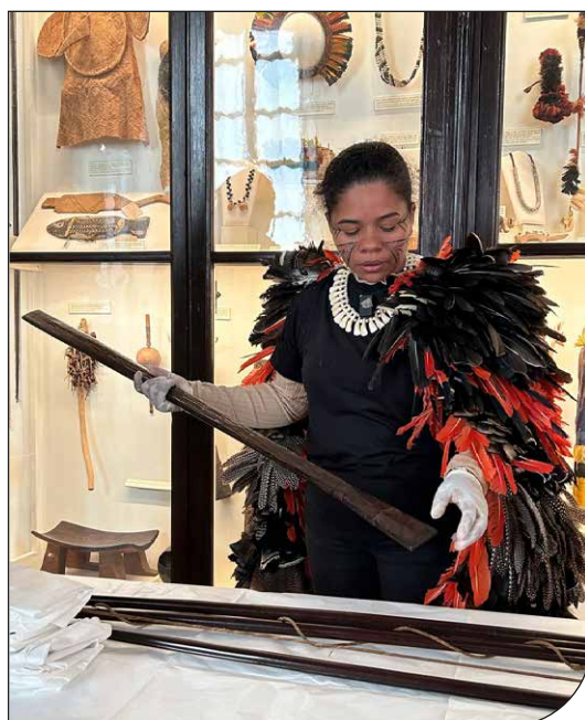
Fig. 4. Glicéria Tupinambá studying the club with incisions and graphism along the handle, traces of red-like pigmentation (cat. n. 280).

Indeed, in this case, years after the anything but simple restoration of the Tupinambá mantle of the Pinacoteca Ambrosiana (Gnaccolini & Rossignoli, 2018), something very special happened: I was involved at the Anthropological Museum of Florence in a sort