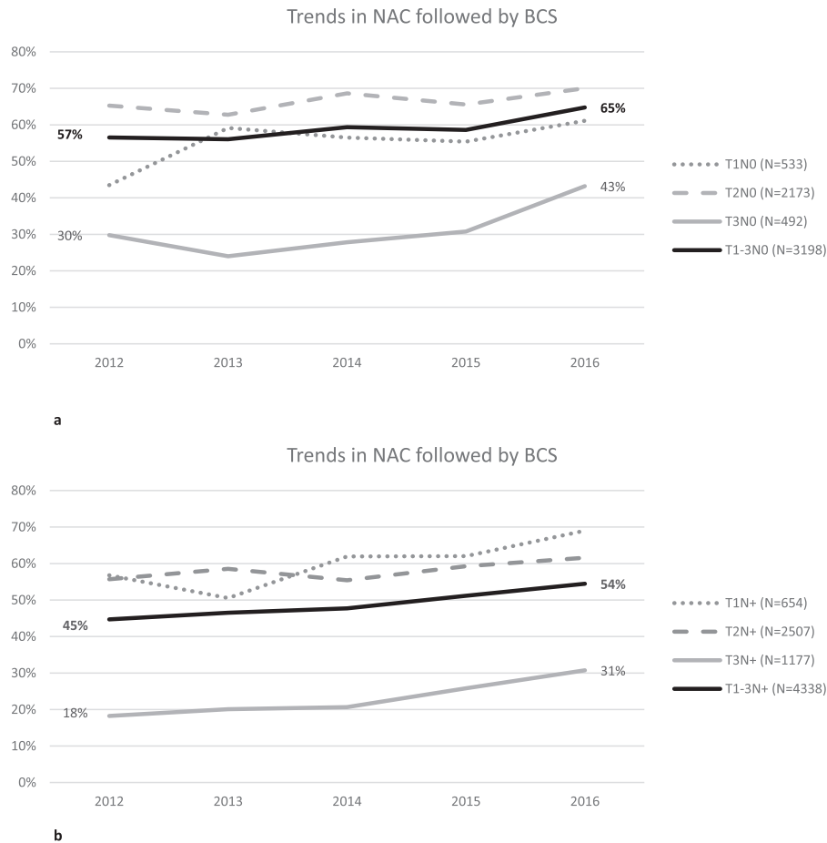
Fig. 1. a Trends in NAC followed by BCS per tumour stage in patients with cN0 disease; 2012–2016. *N = patients treated with NAC. b. Trends in NAC followed by BCS per tumour stage in patients with nodal involvement; 2012–2016. *N = patients treated with NAC.

invasive margins and 6,7% (n = 281) had more than focally involved invasive margins. The re-excision rate was 6,6%; consisting of