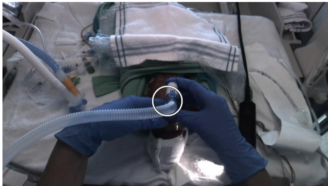
Figure 1 Snapshot of an eye-tracking video showing a healthcare provider performing positive pressure ventilation. The white circle indicates the visual focus of the provider.

(n=5) and umbilical line insertion (n=5). With these recordings, we conducted nine video-based observations (three on-site only and six on-site and online simultaneously) with a total of 88 observers filling in the questionnaire after the video-based observation. We included a short video clip with parts of recordings of a neonatal intubation, an umbilical line insertion and a MIST procedure as online supplemental material.