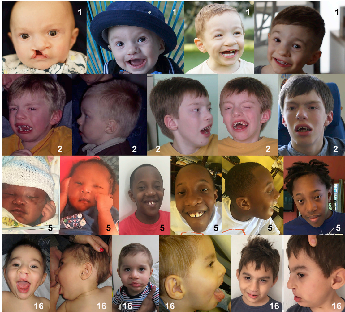
Figure 2. Evolution of the facial features of individuals affected with PHF8-XLID Photographs of individuals 1, 2, 5, and 16.

reported age at walking for 13 of the 16 individuals was delayed with a mean of 20 months and standard deviation of 7 months. Two individuals were not able to walk, and had to use a wheelchair. Birth length was available from seven individuals and the mean was 48.25 cm (50th centile); birth weight was 2.68 kg (10th centile), and birth head circumference from six individuals had a mean of 33.4 cm (25th centile).