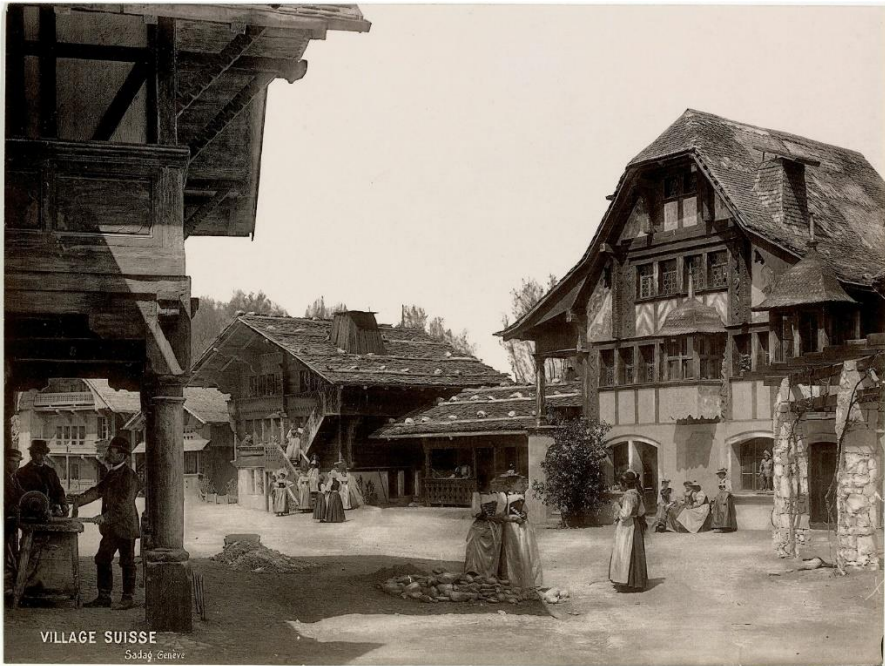
Fig. 2. The Swiss Village at the Swiss National Exhibition in Geneva in 1896. This ethnographic village contained no less than 56 typical buildings from all Swiss cantons, an artificial mountain, a lake and a cascade and was inhabited by over 300 traditionally dressed villagers. The village was such a success that it was rebuilt at the Paris Universal Exposition of 1900.

Ethnographic villages offered the opportunity to give a more vernacular interpretation of a territorial identity. At Chicago's World's Colombian Exposition of 1893, no less than twelve ethnographic villages could be visited and these would become a regular feature of successive world fairs [Fig. 2]. Probably one of the last international expositions where ethnographic villages played a major role was the Brussels Expo of 1958, which hosted both a Congolese village and a Merry Belgium Village.