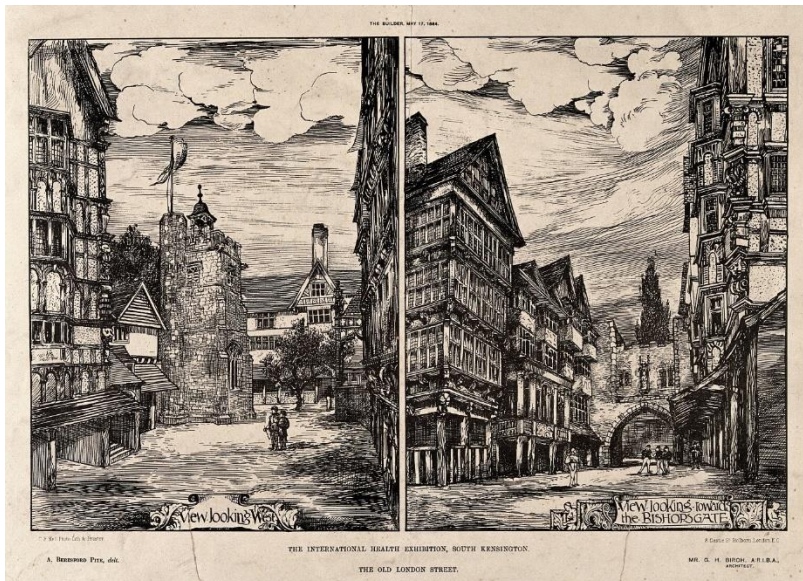
Fig. 1. The Old London Street at the International Health Exhibition, South Kensington, London. From The Builder (17 May 1884). Source: Welcome Collection, public domain.

Trade Fair of 1883 or the 1933 Century of Progress International Exposition in Chicago. Another possibility was to represent the city's own past. Thus, Old London, an ensemble with twenty-five reconstructed historical buildings at the International Health Exhibition of 1884, was a huge success among visitors. As a result, similar large-scale representations of the architectural heritage of the host city became a regular feature of subsequent exhibitions [Fig. 1]. 3 Stateless nations, such as Scotland, Flanders and Catalonia, had difficulties participating in their own right at world fairs, but they were particularly active in organizing major international exhibitions themselves. Glasgow, Edinburgh, Antwerp, and Barcelona, for instance, organized various world fairs, which helped to give them and their Scottish, Flemish or Catalan home regions global exposure. 4