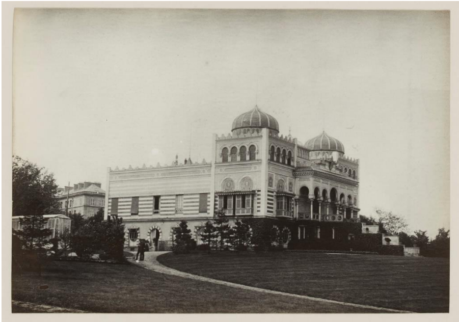
Fig. 4. The French architect Alfred Chapon built the Tunisian pavilion for the Paris Universal Exposition of 1867. It was a faithful copy of the Bardo Palace of the Bey of Tunis. After the fair it was rebuilt at the Montsouris Parc, where it survived until 1991. Photo Hippolyte Blanchard, around 1890, Musée Carnavalet, public domain.

nation's products and artistic riches, both of which affected a country's reputation negatively. Lessons — what pavilions and exhibits were a success and which ones did not work out well — were taken very seriously and, if required, countries and entrepreneurs modified their thematic focus, the design of their pavilions and their exhibition techniques in order to be more attractive to an international audience. World fairs were therefore part of a global learning process about how to represent a national identity in a favourable light to an international audience.