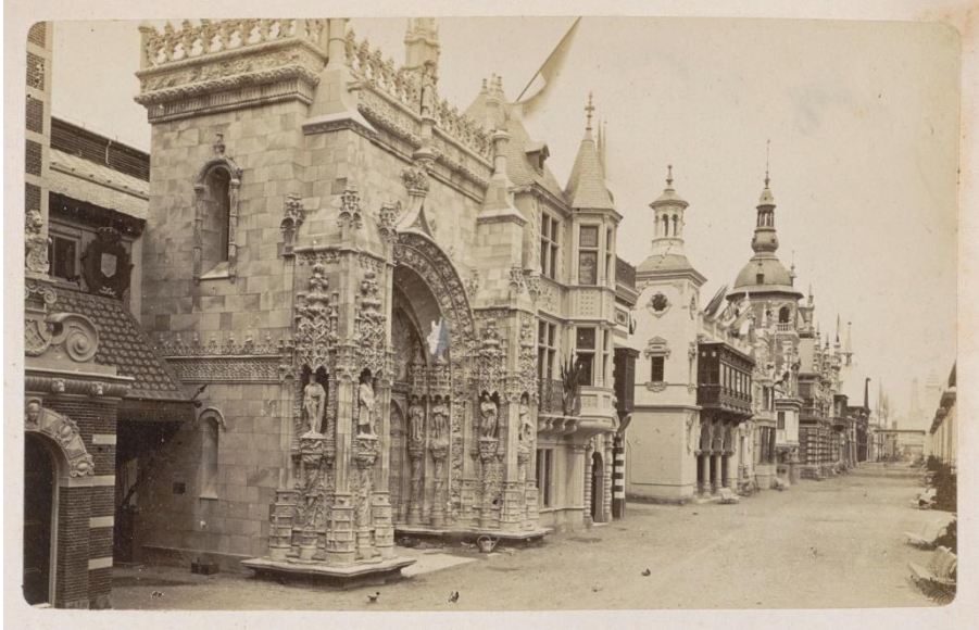
Fig. 5. The Rue des Nations at the Paris Universal Exposition of 1878. The gothic façade represents Portugal and to its right Luxemburg, Tunisia, Siam, Central America, Denmark, Greece and Belgium.

fortunate decisions, while signalling promising innovations that had caught their eye during the exhibition as a source of inspiration for the future. Entrepreneurs, museum officials and other professionals often had an added financial incentive to explore fresh opportunities, especially those that had attracted large crowds.