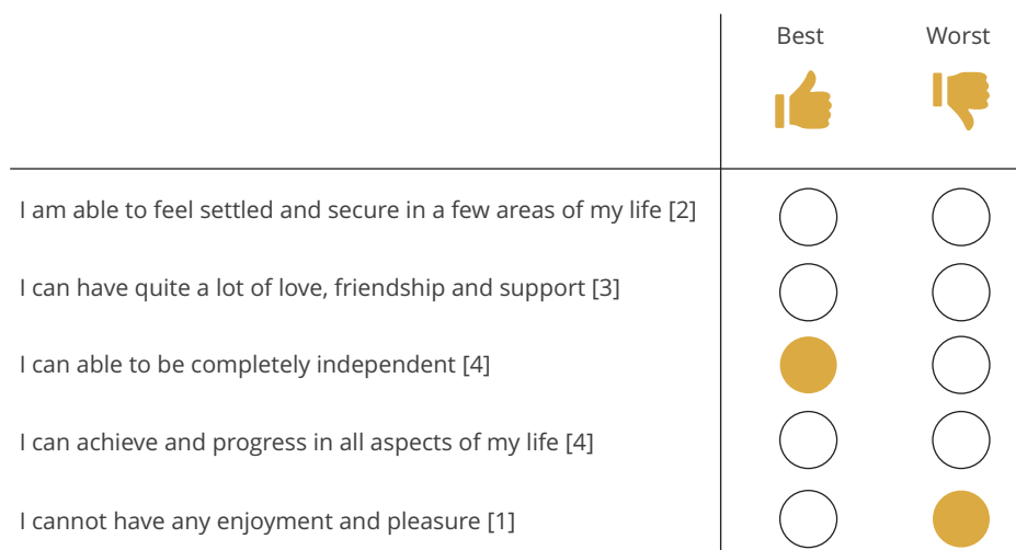
Figure 1. Example of a completed best-worst profile. Note. Sixteen such profiles were completed in Dutch by participants.

The number in straight brackets [#] indicates the level of the corresponding statement, ranging from [1], the lowest level, to [4], the highest level. In the example, the participant evaluated statement 3 “completely independent” to be the best (ie, adds the most to a valuable life) and statement 5 “cannot have any enjoyment and pleasure” to be the worst (ie, obstructs having a valuable life the most).