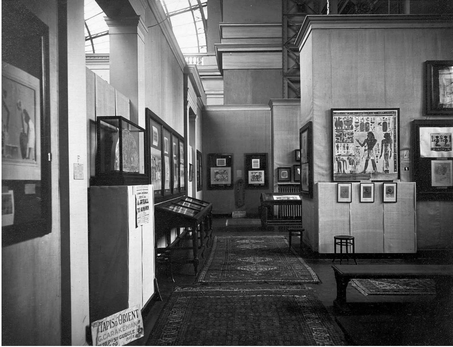
Fig. 5: The exhibition Peintures thébaines at the RMAH in 1924.

More importantly, the FÉRÉ established itself as a respected association in the field of Egyptology through the organisation of scientific colloquia, excavations, and an extensive program of publications. Twice the team organised a Semaine égyptologique et papyrologique de Bruxelles (1930 and 1935), which is discussed in more detail below (see p. 158). These were the first international conferences ever held exclusively for Egyptologists and Papyrologists. In Egypt, archaeological activity was only gradually undertaken, beginning modestly with short seasons at Sheikh Fadl (1924) and Tell Hiw (1927), then growing into a long term project at Elkab, starting in 1937. 29