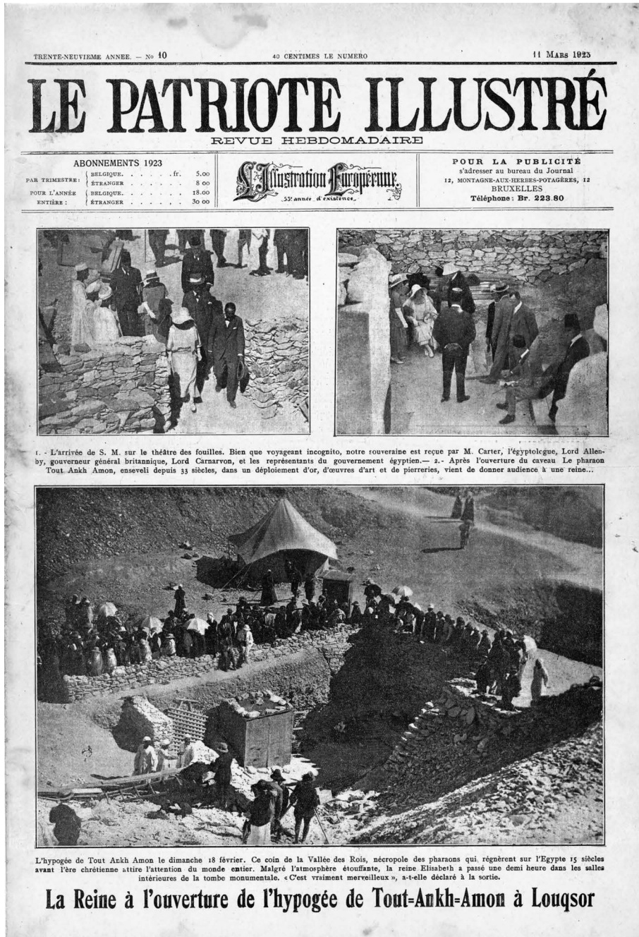
Fig. 1: Front page of Le Patriote Illustré (11 March 1923) documenting the travels of Queen Elisabeth, Prince Leopold, and Jean Capart in Egypt.