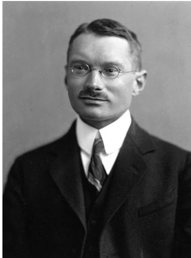
Fig. 1: Frans Marius Theodor Böhl (1882–1976) in 1925.

The main figure in this case study is Frans (de Liagre) Böhl. 2 His father was an Austrian protestant minister and theologian, his mother a Dutch baroness. As a