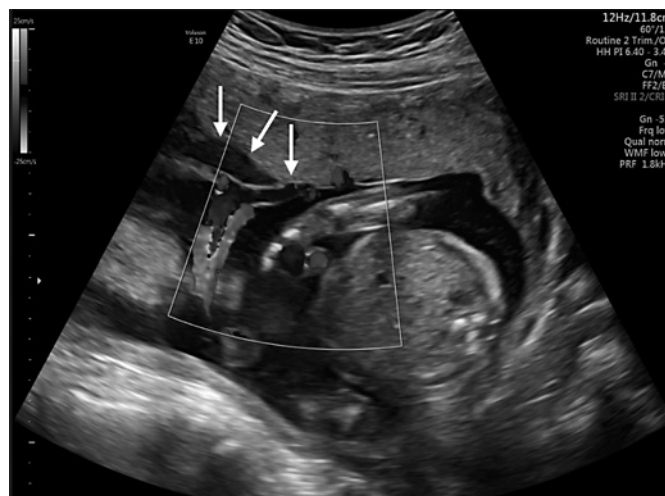
Fig. 1. Ultrasound image at 19+4 weeks of pregnancy showing the subamniotic lesion (arrows) located next to the umbilical cord insertion of the placenta. Within the subamniotic lesion, no flows were detected using doppler.

The advanced ultrasound at the Prenatal Diagnostics and Therapy department (Radboud University Medical Centre, Nijmegen, The Netherlands) at 20+4 weeks gestation showed an echolucent lesion on the surface of the placenta (shown in Fig. 1) with the umbilical cord insertion positioned just at the height of this lesion (shown in Fig. 2). The differential diagnosis for an echolucent placental lesion includes a subamniotic hematoma, a subchorionic hematoma, placental and umbilical cord (pseudo-)cyst, a (partial) molar pregnancy, a chorangioma, or a chorangiocarcinoma. Within the lesion, no flow was seen with color doppler, which excluded the possibility of a chorangioma. Fetal biometry was consistent with gestational age, and no fetal anomalies were detected. Doppler evaluation showed a peak systolic velocity (PSV) in the middle cerebral artery (MCA) at 1.4 MoM, just below the threshold for characterizing fetal anemia ( <1.5 MoM) [6].