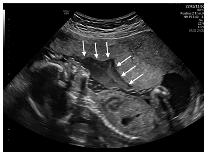
Fig. 2. Ultrasound image at 19+4 weeks of pregnancy showing the subamniotic lesion (arrows).

Because of the lack of flow inside the lesion, the position of the hematoma, and the possibility of fetal anemia (PSV in MCA at 1.4 MoM), a subamniotic hematoma was considered most likely the cause. There was no indication that a trauma could be the cause of the bleeding and FNAIT was suggested as an underlying mechanism. Laboratory evaluation showed maternal HPA-5b allo-antibodies and amniocentesis confirmed that the fetus was HPA-5b-antigen positive. A week later, PSV of the MCA was reduced (1.0 MoM). In the meantime, a fetal magnetic resonance imaging (MRI) scan of the brain was performed to look for signs of ischemic cerebral damage due to a possible hypovolemic shock by the