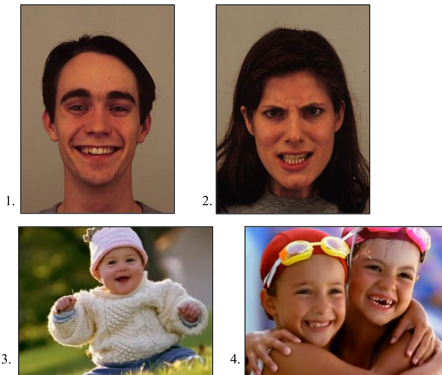
Fig. 1. Examples of photographs in the Static Faces paradigm: (1) happy face and (2) angry face (taken from KDEF; [25]). Screenshots of video clips in the Dynamic Social Information paradigm: (3) single face and (4) multiple faces

29.73° visual angle were presented in an alternate order (i.e., single, multiple, single, multiple). In each trial, a video clip was presented to the child. In the single face condition, one face of a child was on the screen; in the multiple faces condition, two or more faces were on the screen (child-child, child-adult, or child-adult-adult). The video clips consisted of subjects with different cultural backgrounds and were extracted from the TV broadcasted series “Baby Einstein” ([22]; see Fig. 1). The videos were accompanied by unsynchronized classical instrumental music, and no speech was involved. As these eye tracking paradigms did not involve language and used age-appropriate stimuli, it was considered to be appropriate for participants in both countries. In a group of non-clinical young children aged 3–7 years, this eye tracking paradigm was found to be significantly predictive of real-life social behaviors, and independent of age, IQ, or gender [46].