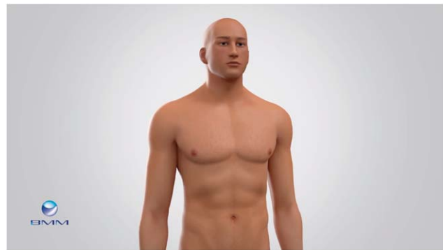
Figure 2. A still from an explanatory video on a regenerative heart valve replacement. The still depicts a person with heart valve disease, as is explained in the voice over. Reproduced with permission from [52].

Therefore, in the design process of regenerative valve implants, developers and clinicians should pay attention to inclusion in the representation of biological differences and social identities of potential users in their written, verbal and visual communication. Language and visual communication should be sensitive to causally significant differences in gender, sexual identities, disability and ethnicity, among others [50], so that these representations accurately reflect a diverse range of potential users.