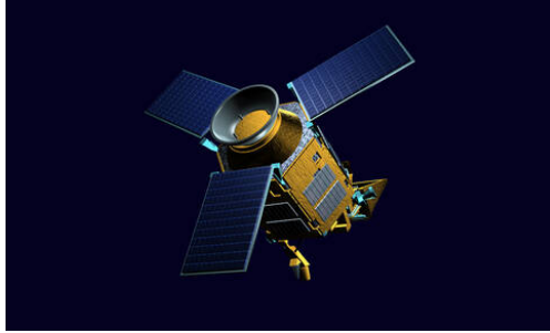
Figure 1.2: Sentinel-5 Precursor satellite.

Absorption spectroMeter for Atmospheric CartographY (SCIAMACHY) [13] onboard the ENVironmental SATellite (Envisat) mission, traces from the shipping industry over the Red Sea were quantified [85]. Finally, data from the Ozone Monitoring Instrument (OMI) [69] aboard the NASA Aura spacecraft was used to visualize the \text{NO}_x emission inventory of shipping in the Baltic Sea [106]. The obtained results were further associated with the temporal patterns of global economic activity [26, 12]. Nevertheless, all the above-mentioned studies were based on multi-month data averaging, which was necessary to perform in order to reduce the signal-to-noise ratio of the satellite measurements and enable distinguishability of \text{NO}_x traces along the shipping lanes. The low spatial resolution of the satellites did not allow for the distinction of ship plumes from individual ships on a daily basis.