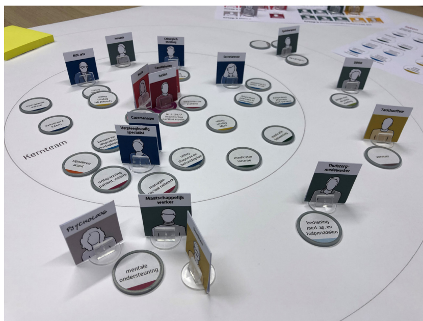
Figure 2 Co-design tool for the layer Companions, with an inner circle including the patient and his/her significant other at the centre and the other people involved on a regular basis, and an outer circle with people who may ad hoc be drawn in, for example, a dietitian, a psychologist.