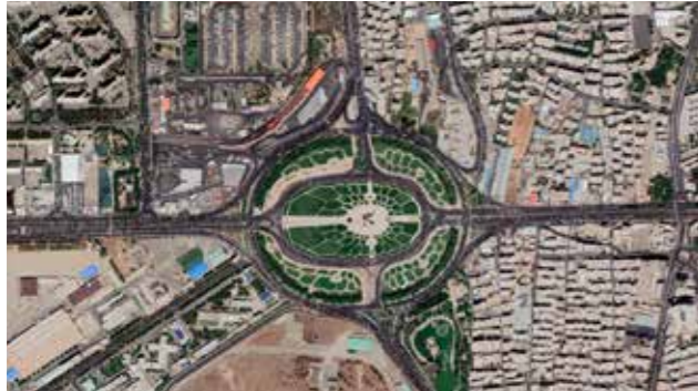
Figure 4. Aerial view of Azadi Square.

approaches the structure, the experience of a monolithic concrete building is replaced with the experience of 'vernacular' engraving, creating a more 'tangible' experience.