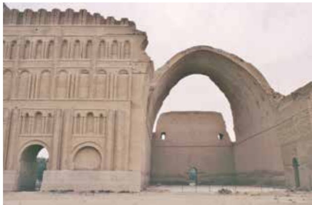
Figure 5. The ruins of Taq Kasra (Madain, Iraq).

In short, the monument allows for experiences of modernity and ancientness at the same time, due to which Shahyad embodies the uncommon representation of both the modern and the un-modern in concrete (Forty 2013, 34). Unifying the past and the present, the monolithic Shahyad monument represents the locus of the creation of Iran's national 'identity'. Its architecture embodies language of form, shape, colour and concrete materiality which enables ambiguous experiences. All this serves to remember, narrate, glorify and legitimize the nation state. Hence, the initial purpose of the monument was to freeze the Shah himself in time and space, as an 'architectural manifesto of Shah's monarchy, his vision, ideology and ultimate aim' (Grigor 2003, 216). The Shah aimed to ascribe political status to the Shahyad monument through association with historical memory and collective imagination of the Sassanid Empire's glorious past. Mehan (2017a, 319) cites that once this memory fades, the monument may be appropriated by new meanings and new ideological imperatives. As such, only Shahyad's physical concrete presence has endured (Grigor 2003, 216).