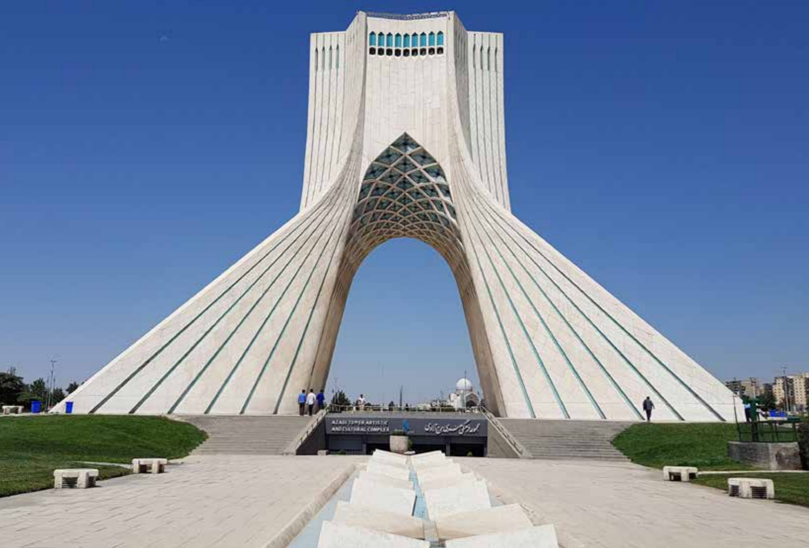
Figure 2. Frontal view of the Shayad monument in Tehran, Iran.

those actors who view themselves as being in control. Tompson (2004, 295) adds that those in control have the power to ensure their objects are durable, whereas those of others are transient. Hence, materials underlie, enable, and naturalize established hierarchies and social orders (Drazin 2015b, 27). Consequently, this conceptual avenue allows for the combination of material, social and political perspectives.