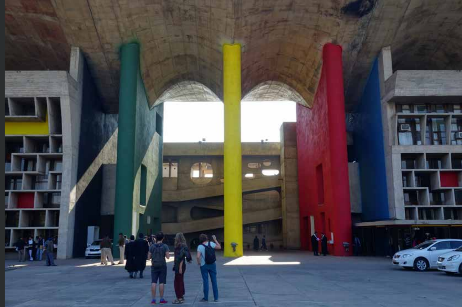
Figure 1. Le Corbusier's buildings in Chandigarh, India.

Corresponding author email: immevdleij@gmail.com