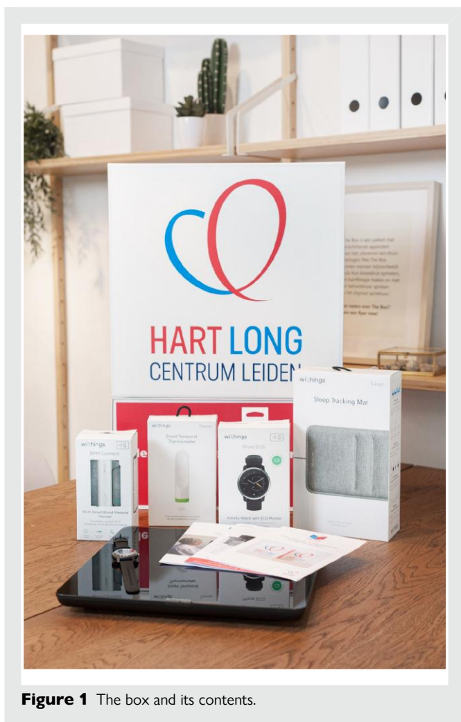
Figure 1 The box and its contents.

a randomly generated code as the individual's login name, combined with a randomly generated password. The @hlc.nl domain is owned and maintained by the LUMC, its data are stored on LUMC servers. Online data from the mHealth devices were accessed via the Application Programming Interface (API; Withings). The Withings API allowed all device data to be automatically imported in the electronic medical records of the LUMC, via a protected authentication protocol (OAuth2). Patients were phoned by eHealth-technicians after two weeks of not receiving any mHealth measurement, reminding them of the importance of these measurements.