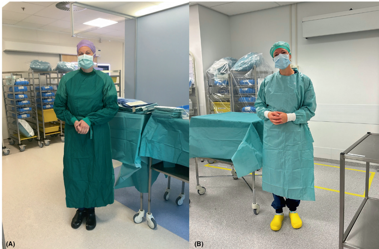
FIGURE 1 Reusable and disposable sterile surgical gowns. (A) Reusable surgical gown. (B) Disposable surgical gown.