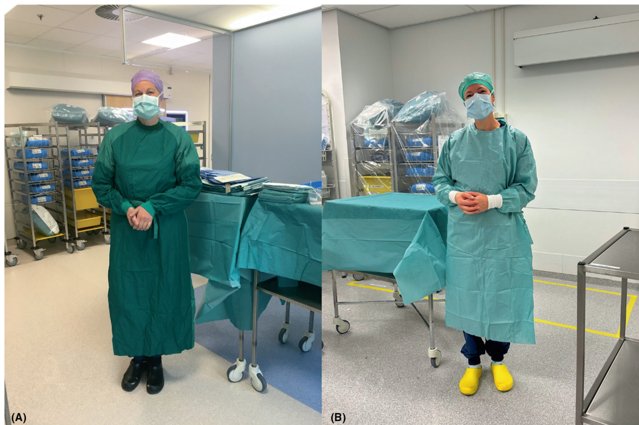
FIGURE 1 Reusable and disposable sterile surgical gowns. (A) Reusable surgical gown. (B) Disposable surgical gown.