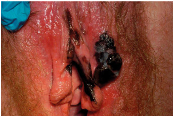
Figure 1. Clinical presentation of vulvar melanoma