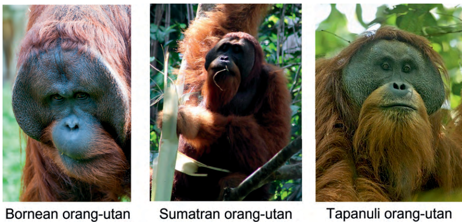
Figure 2. Pictures of flanged males of each orang-utan species. Left picture: courtesy of Ronald van der Beek. Middle picture: Tom Roth. Right picture: Tim Laman (redistributed under CC BY 4.0).

traits and attention. While we know that secondary sexual characteristics affect cognitive processes such as attention in humans (Garza & Byrd-Craven, 2023; Yang et al., 2015), this topic has been virtually unexplored in great apes. However, to develop a full understanding of the evolutionary underpinnings of such attentional biases, it is important to test a wide range of species (Smith et al., 2018), ideally with different mating systems (Petersen & Higham, 2020). Because orang-utans are a suitable model organism for this topic, part of this thesis investigates whether Bornean orangutans show cognitive biases towards flanged males.