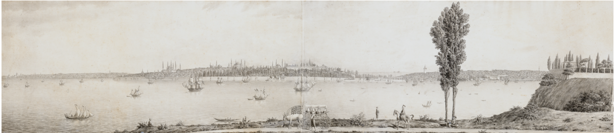
Figure 4: Panoramic view of Istanbul from Üsküdar. Anonymous. Early nineteenth century. Ink and watercolor on paper, 31.5 x 138.5 cm. Suna and İnan Kıraç Foundation Orientalist Paintings Collection, inv. 282.

liminary sketch for a work that was to be reproduced on a giant scale and exhibited in a European capital, as was the case with Barker's work.