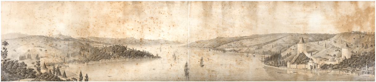
Figure 3: Panoramic view of Istanbul from the ridges of Kanlıca. Anonymous. Early nineteenth century. Ink and watercolor on paper, 31.5 x 142 cm. Suna and İnan Kıraç Foundation Orientalist Paintings Collection, inv. 281.