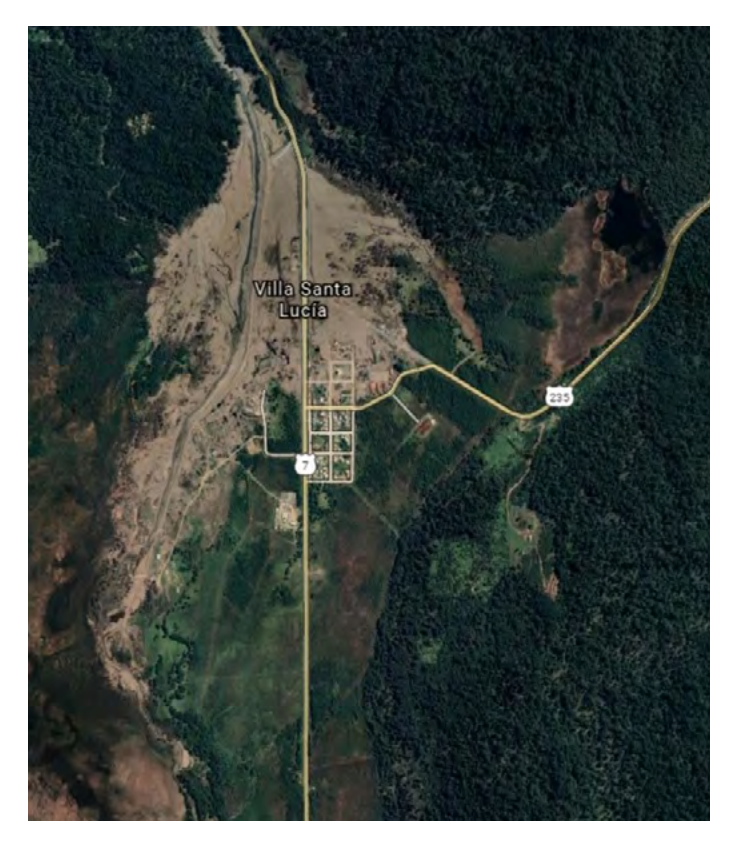
Villa Santa Lucía was severely damaged by a mudslide in December 2017. Residents chose to stay.

In Weija Gbawe Municipal District in coastal Ghana, the government used community-based communication tools to inform exposed communities about the risk of living in a perennial flooding area. The aim was to help people make more informed decisions on moving or not, without forcing them to relocate.<sup>10</sup>