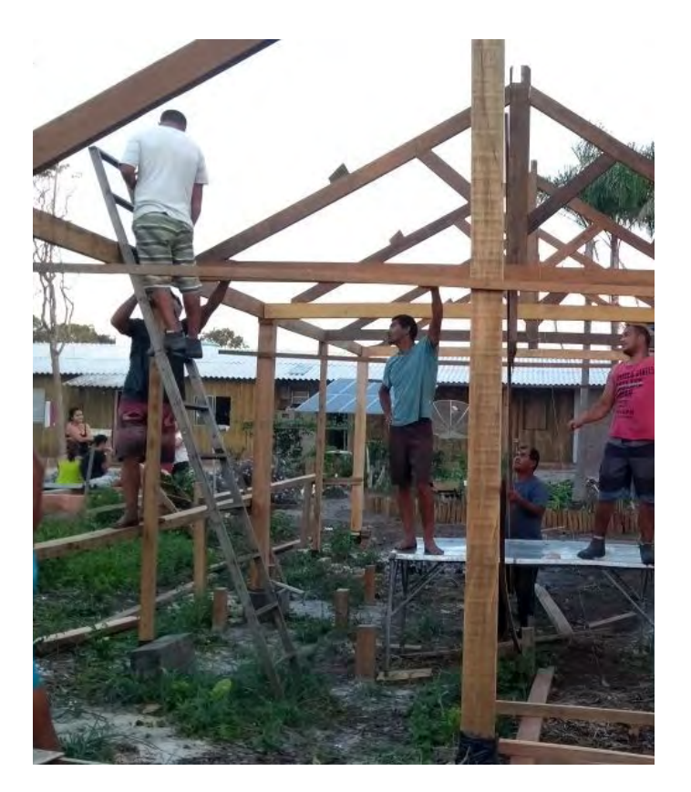
Community members build a house in Nova Enseada, their chosen relocation site.

Faced with severe erosion, frequent storms and rising sea levels, Cardoso Island, Brazil, broke in two, forcing the Enseada da Baleia community to relocate. The community refused the government's relocation plan because the proposed location would have disrupted their community traditions, identity and internal organization. The government suggested two options: moving to the nearest city or relocating within one of the other communities on the island. Both solutions were imposed top-down, without consulting or incorporating the views and needs of the community. Instead, the community organized their relocation without financial support from the government, relying on traditional knowledge to protect their way of life and cultural traditions. They chose a place that would guarantee the preservation of their values, identity and traditions. The case of Enseada da Baleia clearly illustrates how collaboration is crucial for planned relocation to proceed while respecting the rights of the communities and integrating their views and needs.3