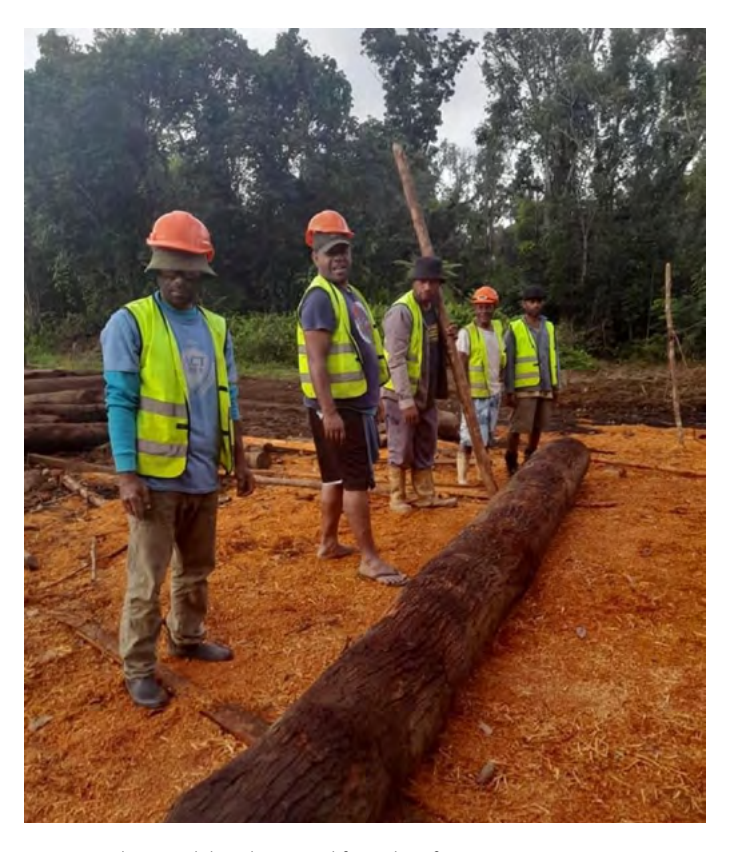
Cogea residents with logs harvested from their forest, to build houses in the new site.

The Government of Fiji has developed guidelines and procedures for relocating communities.<sup>6</sup> The community-led relocation project in Cogea, supported by FCOSS and Brot für die Welt, illustrates the importance of community inputs when formulating and applying such frameworks. After devastation by tropical cyclone Yasa in 2020, the residents requested a Trauma Informed Awareness and Healing Program. Led by FCOSS and Transcend Oceania, this programme transformed their perceptions of the proposed relocation. Their support increased: gifting land, wood and manpower to build 30 new houses. The application of national relocation frameworks appears positive in Cogea because of deep engagement with the community.<sup>7</sup>