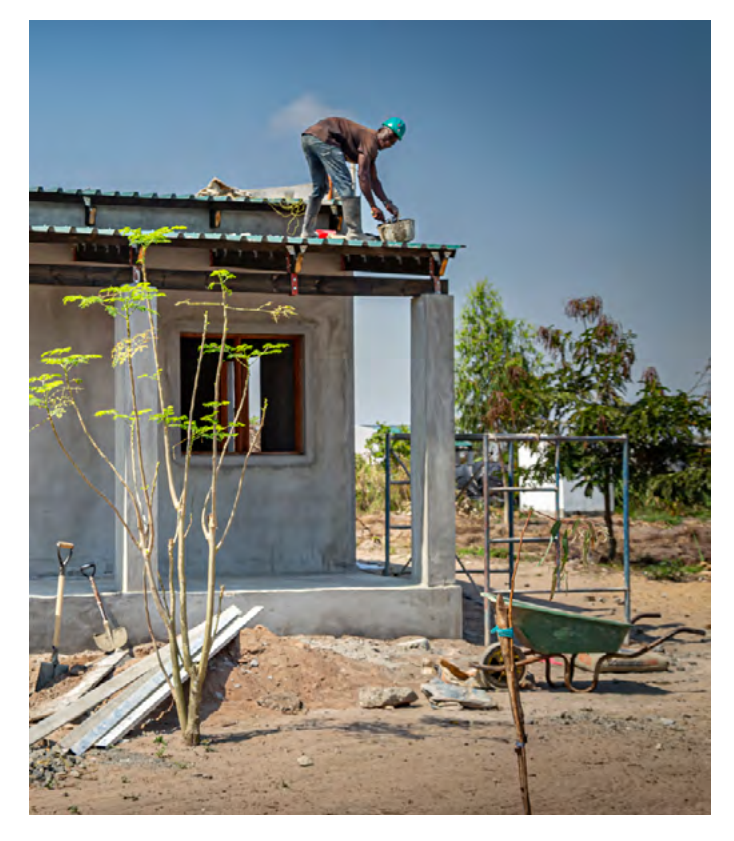
At a relocation site in Mozambique, workers recruited from both within and outside the community build more durable houses, four years after the site was opened using temporary shelters.

Relocating people from high-risk areas to safer places is an ongoing process in Mozambique. After cyclone Idai, it happened at large-scale. At first, people received small plots of land and tents. This was appropriate as an emergency response, but not sustainable in the long term. Thereafter, people received construction materials to build semi-durable houses. Four years after the relocation, more durable houses are being built, while available basic services are gradually improving. The government is still committed to make relocation work.8