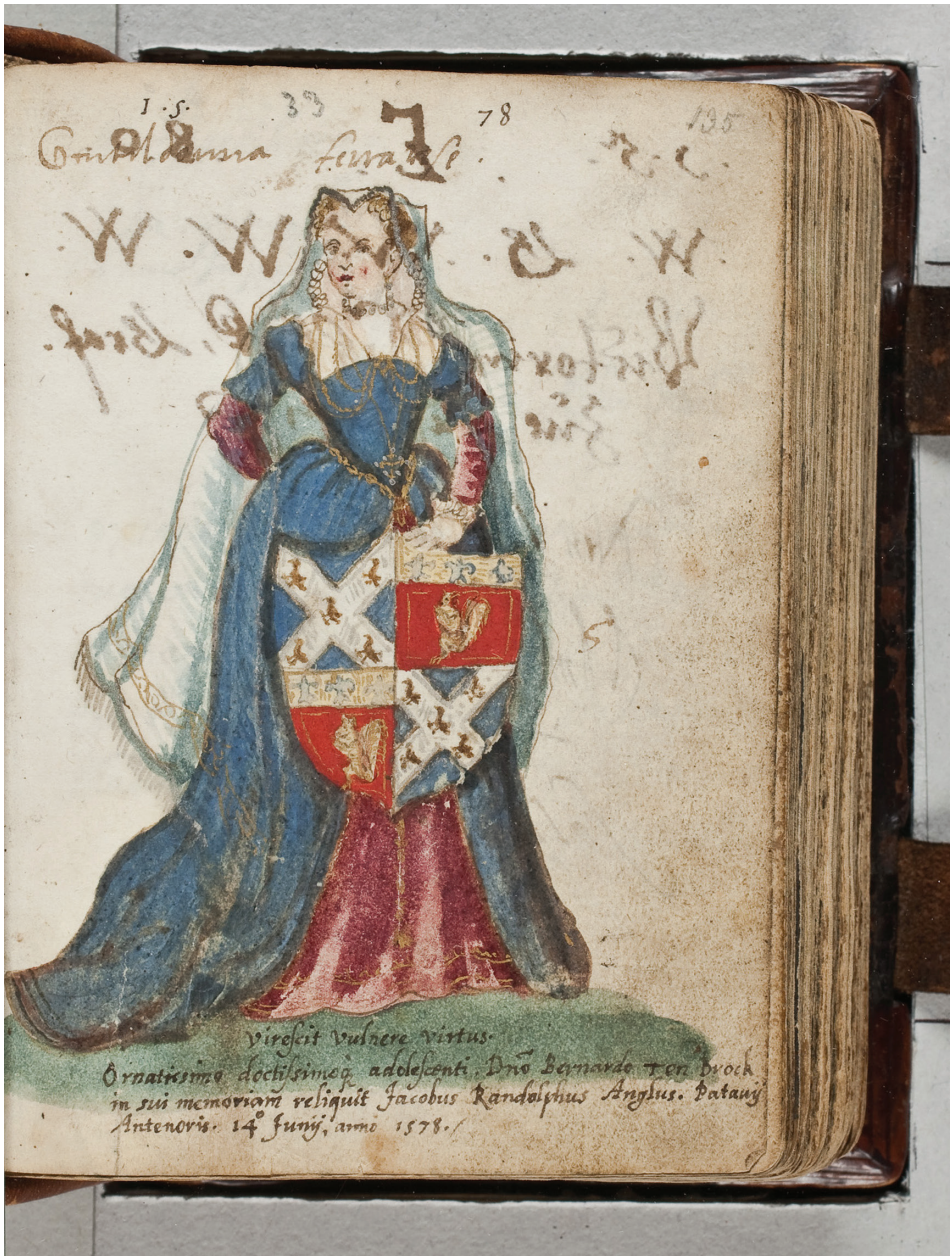
Fig. 4 Contribution by James Randolph, with image caption by Paludanus, in the album amicorum of Bernardus Paludanus, 14 June 1578, pen and gouache on paper, The Hague, Koninklijke Bibliotheek.