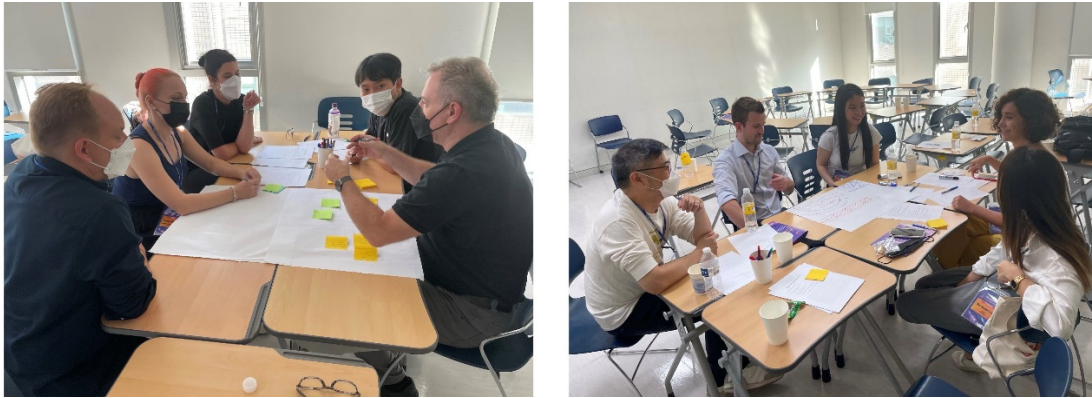
Figure 1: Participants discussing and prototyping empathic in-vehicle display features adapting to use cases.