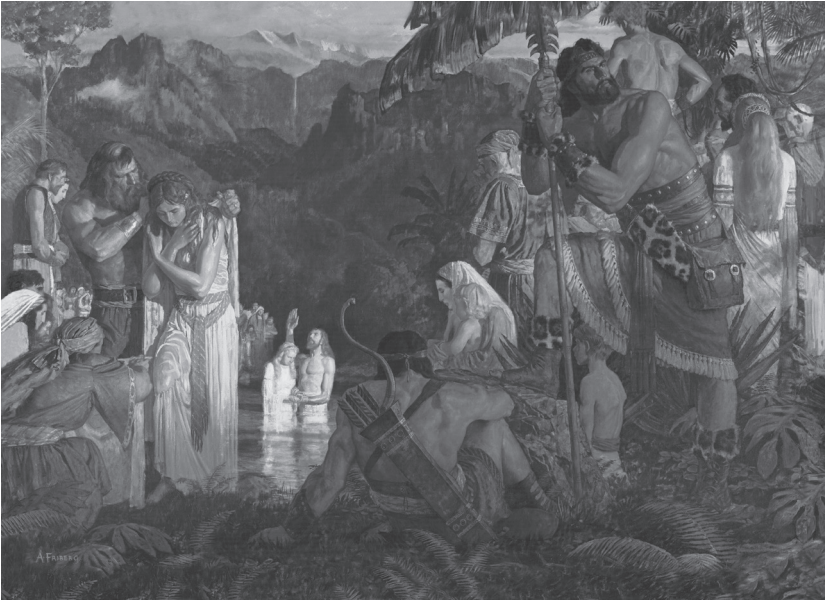
The message of the Book of Mormon is fully Christological: Artist's impression of a central Book of Mormon prophet, Alma, who baptizes his followers.

but for experienced DBM-readers the change is striking. For the translator of DBM-1993 and DBM-2004, 89 years old at the time of our writing, this shift to jij, jou, jullie was a bridge too far, but she told us: 'Have courage, history will change again.' She is probably right.