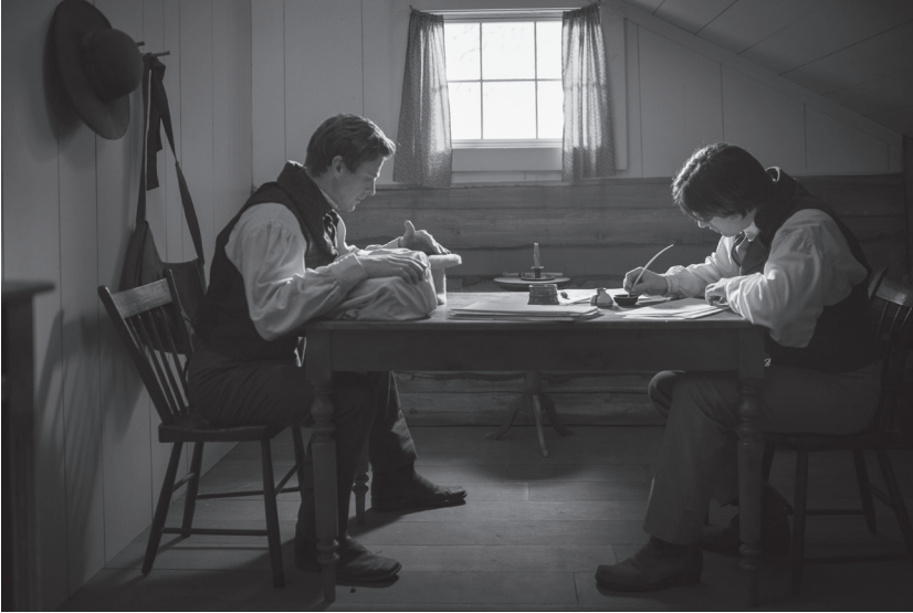
In 1829 Joseph Smith (left) dictated the text of the Book of Mormon to his scribe Oliver Cowdery (right). Picture from the Church's Restoration Project.

Mormon, are joined at the hip. Since the 1830s it has served as its main vehicle for missionizing, while in public discourse 'Latter-day Saints' quickly became 'Mormons', with their religion dubbed 'Mormonism'. Church members hear the injunction to 'read the Book of Mormon' repeatedly and missionaries are expected to 'place' the Book of Mormon and ask their potential converts to pray about its truthfulness. Testimonies of members often center around the veracity of the work. For them, it has the same authoritative status as the Bible. At the scholarly level, considerable efforts have gone into the study of the book's genesis and its textual features. 3