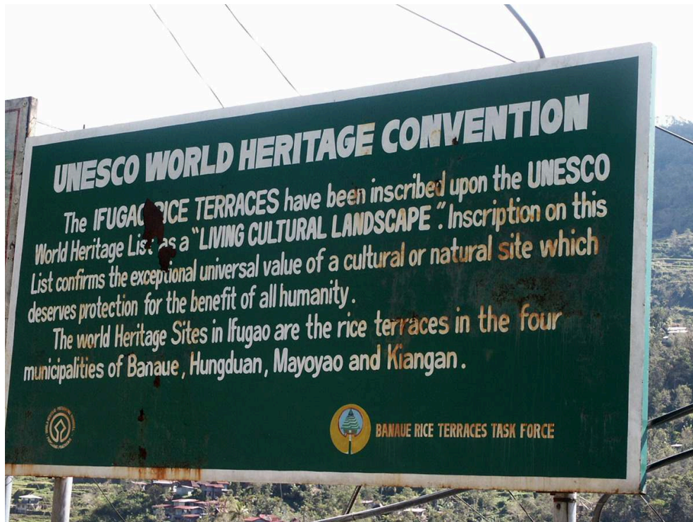
Figure 7 : Unesco Billboard