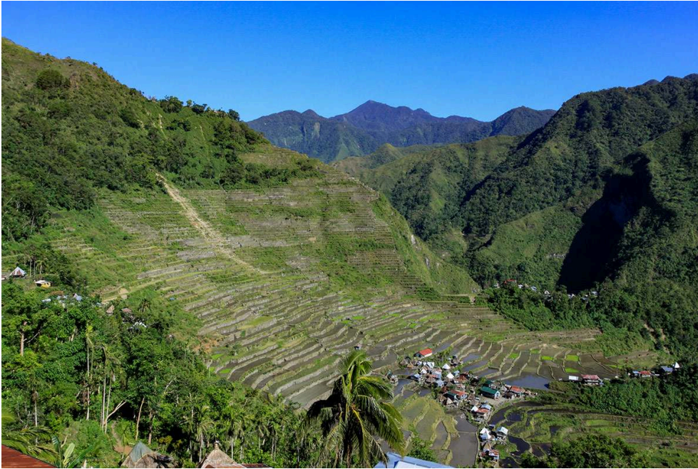
Figure 22 : Batad 2012. The same rice fields showing the damages after the hurricane in 2012