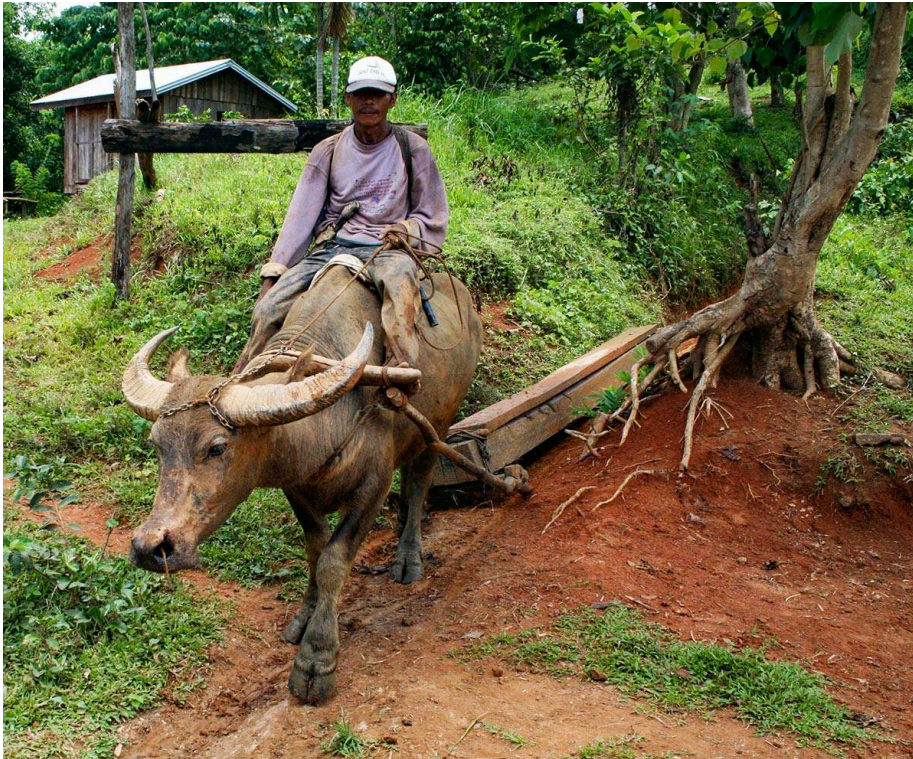
Figure 16 : Carabao logging