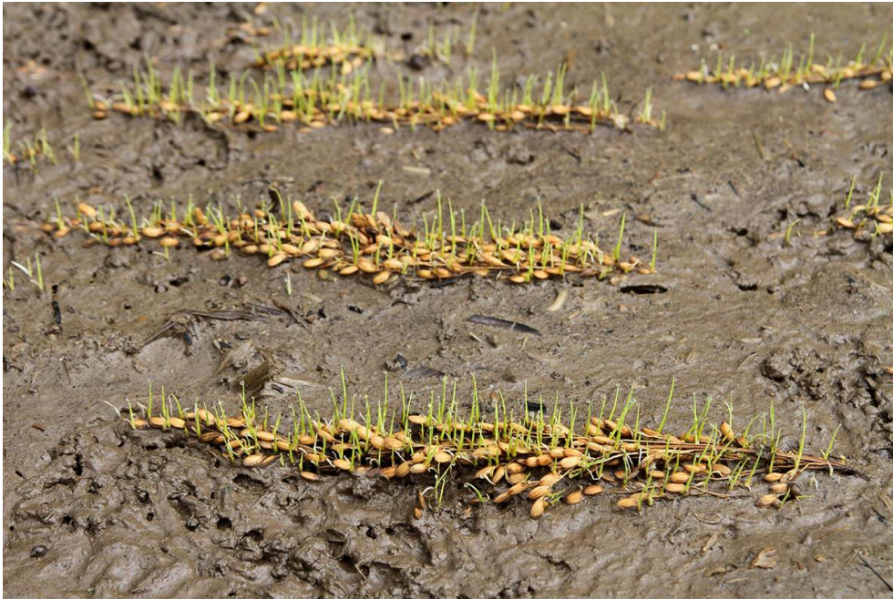
Figure 5 : Rice seedlings. Sprouting traditional rice seeds in Banaue