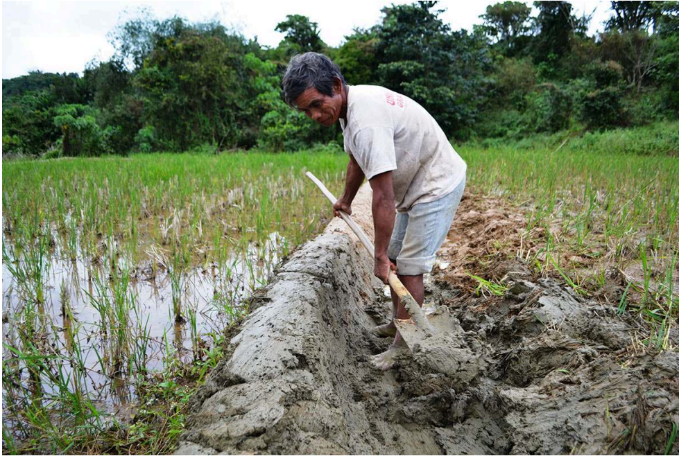
Figure 12 : Construction of rice fields in the Sierra Madre is less labour intensive compared with the Ifugao homeland