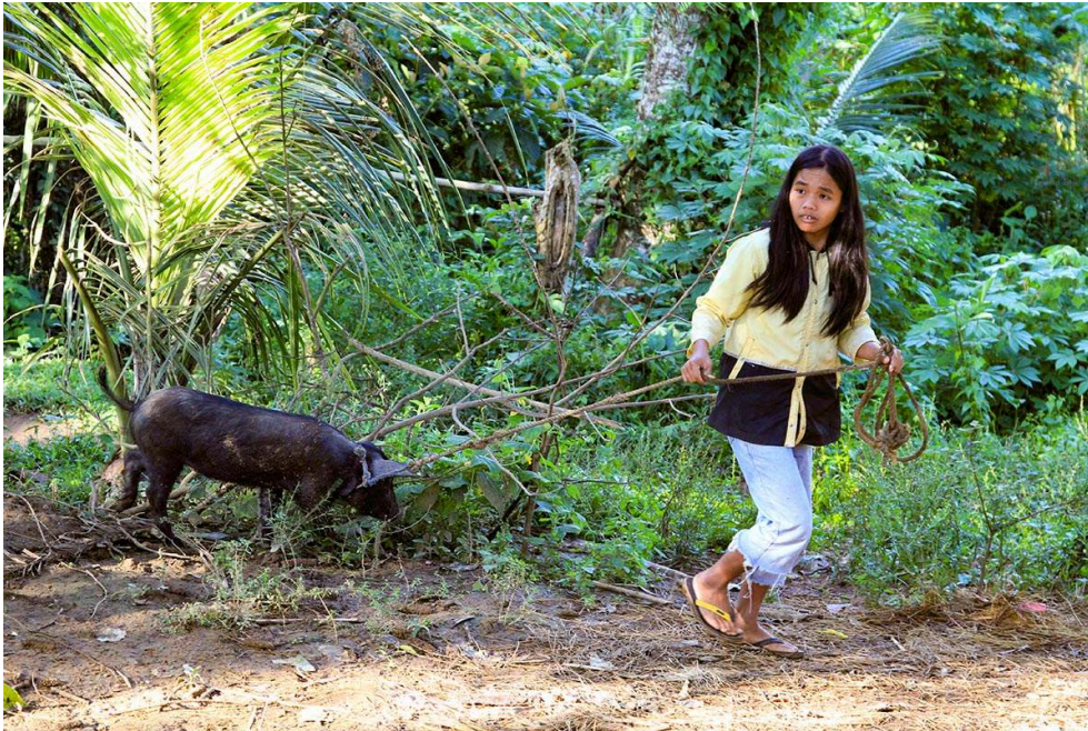
Figure 20 : Girl with pig