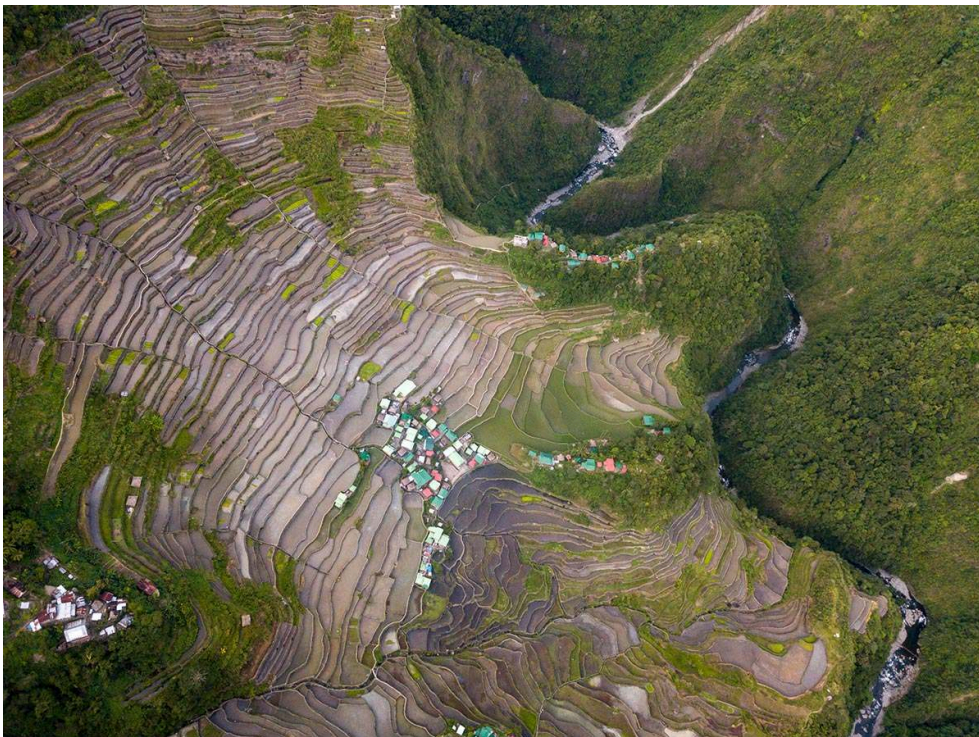
Figure 24 : An aerial image of Batad, taken with a drone

and makes affordable the use of aerial images in field research (Figure 24). In the water course, aerial images generated with drones are now regularly used to study land use, land-use change and impacts of deforestation and of typhoons. High-quality aerial photographs of all the different field ponds, with their different shapes, sizes and connections, enable a much better understanding of the organization of the Batad rice terraces, including the impact of typhoon Nesat on water flows. In Batad, this drew the attention of the elder Addug, who also saw possibilities to solve land ownership issues using drone-generated aerial photography, and better understand the impact of migration and neglect of pond field maintenance on the overall functioning of the rice terraces.