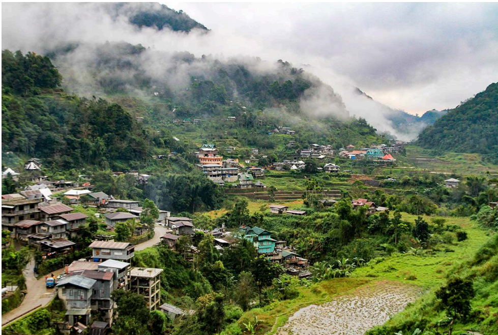
Figure 9 : Expansion houses Banaue. New houses, hostels and shops are constructed amidst the rice terraces

terraces, or could not mobilize sufficient labour to conduct regular maintenance work. With new opportunities to generate income in the tourism business (run a hostel, work as a wood carver or act as guide), some were willing to give up rice farming. Some farmers had changed to other more profitable vegetable crops such as cabbage and carrots, which do not need to grow in terraces and do rather well on non-terraced slopes. New high-yielding varieties of rice, the result of the Green Revolution, disturbed the more uniform rhythm of the activities related to the cultivation of rice such as maintenance of the terraces and irrigation canals. Young people also left the area to pursue further education or employment in Baguio or Manila. Others heard about the availability of arable land in the sloping hills of the Sierra Madre Mountain Range on the eastern side of the Cagayan Valley. As a result, there was simply not enough labour available to do the necessary repair work. Another « disturbing » factor in the traditional landscape is also the construction of small houses and hostels, with galvanized metal roofs and « hollow block architecture ». These buildings do not fit with the claim of an « ancient heritage landscape » and do not contribute to the photogenic landscape that tourists would like to see (Figure 9).