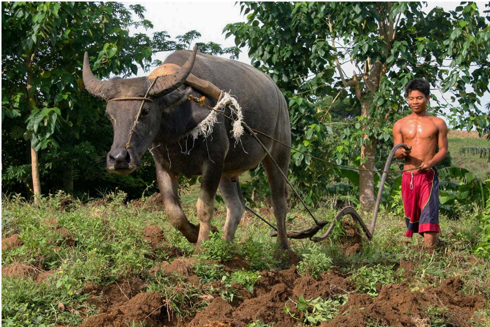
Figure 14 : Carabao plowing

beans, cowpeas and green pea. An important perennial crop is also the betel nut palm from which betel nuts are harvested. Chewing the nuts in combination with some lime is an old Ifugao tradition for men and women, just as in many other Southeast Asian communities.