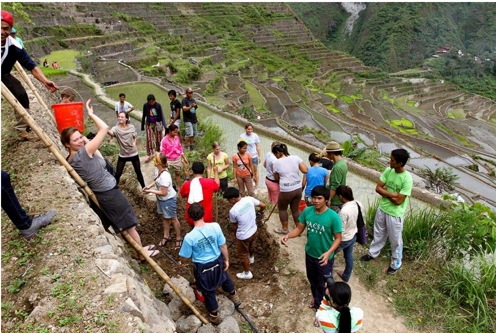
Figure 23 : Students of the water course are helping to restore the damaged stone-walls in Batad