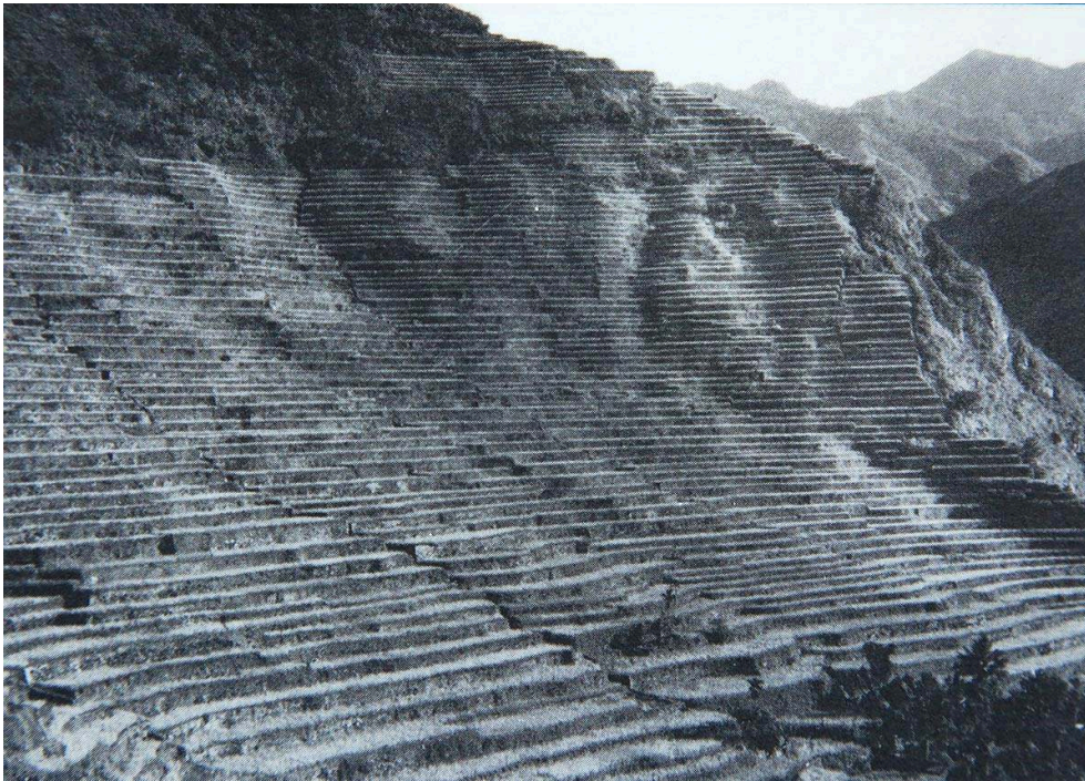
© Conklin 1980, photo 21. Picture taken sometime in the 1970s