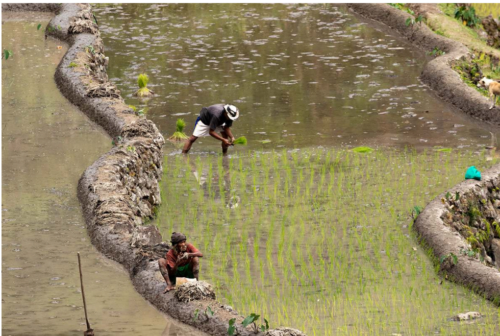
Figure 6 : Planting rice in Banaue