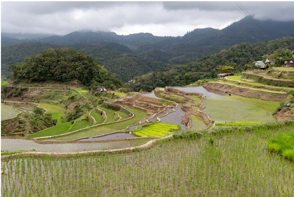
Figure 3 : Rice terraces in Banau shortly after the planting season