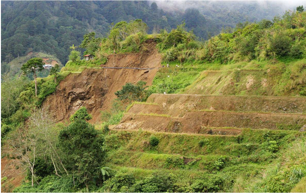
Figure 8 : Damaged rice field. Lack of maintenance of the rice fields causes landslides and erosion

how they want to do that, and also on the amount of labour they can invest in the maintenance of the terraces. As early as the time of the inscription as a World Heritage Site, it was clear that the level of maintenance of the terraces was insufficient. Parts of the terraces were overgrown with weeds, and some of the stone walls had collapsed, causing small landslides at times of heavy rainfall (Figure 8). By 2001 the threats were so serious that the site was put on Unesco's list of « World Heritage in Danger ».