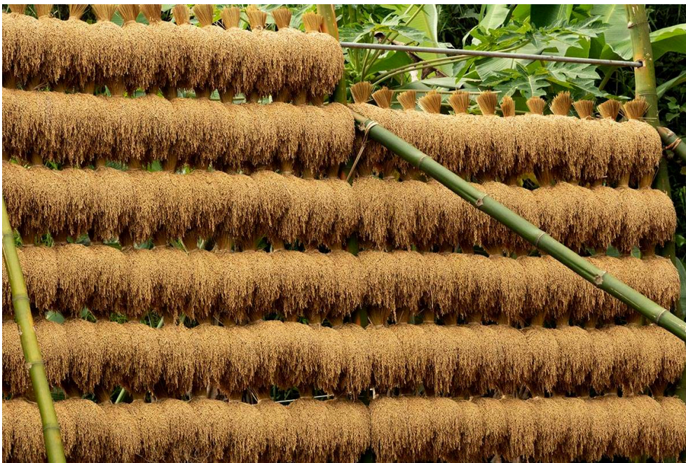
Figure 10 : Drying heirloom rice. Traditional rice has become a commercial product as « heirloom rice », sold to tourists and urban supermarkets