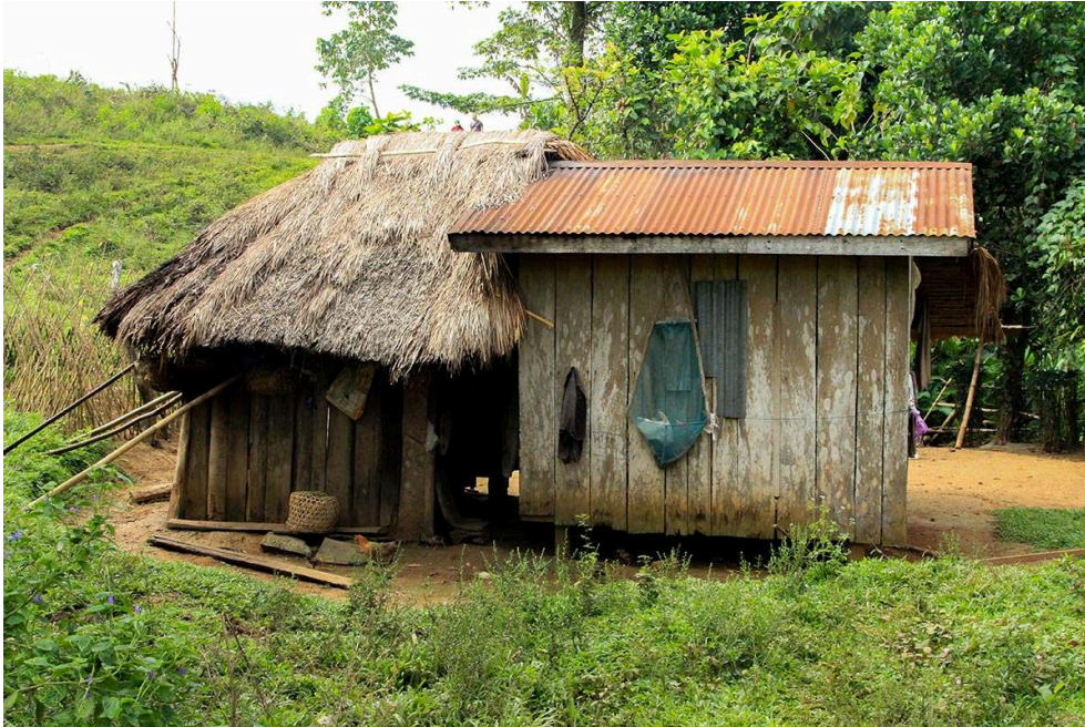
Figure 13 : Ifugao house