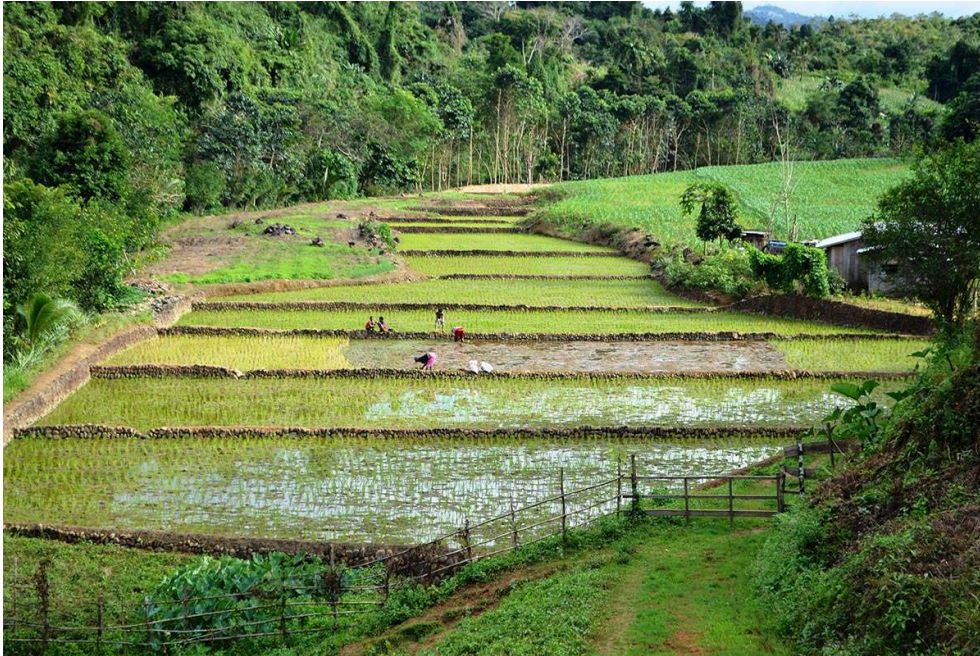
Figure 11 : Ricefield at forest edge. Near Diwagden, in de foothills of the Sierra Madre, Ifugao have constructed rice terraces at the edge of the forest

the terraces for the rice paddies required far less effort in this area, as stones were abundantly available in the nearby riverbeds and, compared with the surface of the rice fields, less construction work was necessary (Figure 12). Their presence automatically drew attention to the cultural and agricultural background of the Ifugao. The wealth of information found in Conklin's atlas, not only in the text, but also in pictures, maps, and other ethnographic material, was a source of inspiration for the students and their Filipino and Dutch supervisors.