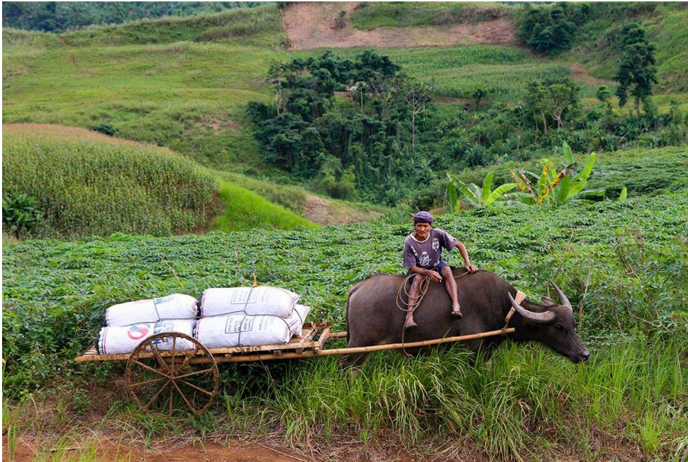
Figure 17 : Carabao Charcoal