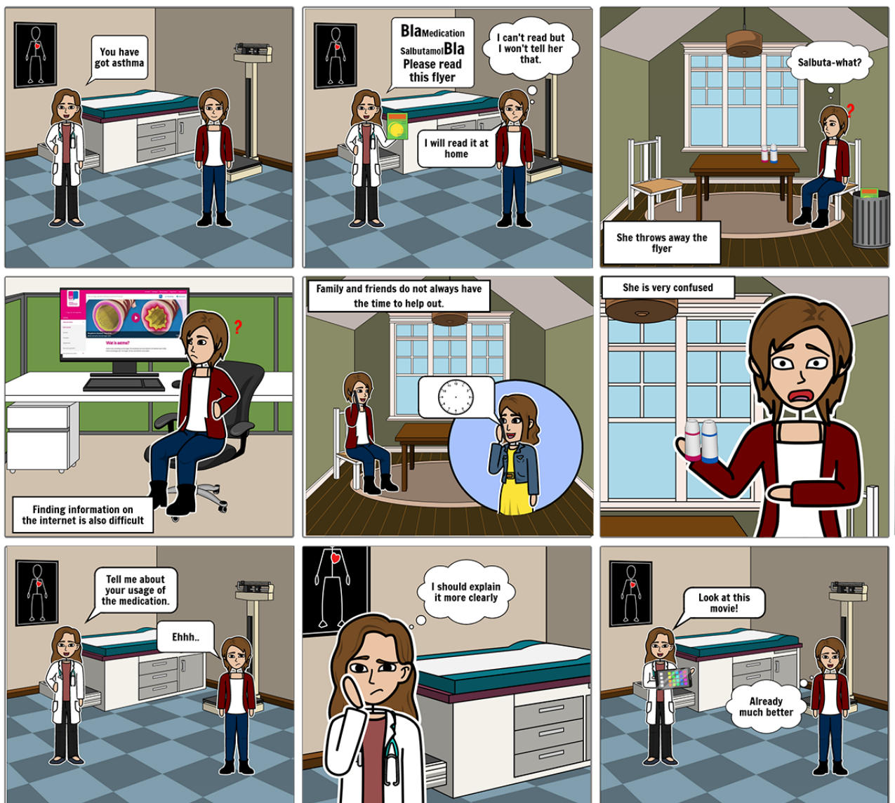
Figure 2. An example storyboard used during the co-constructing story sessions (translated into English).

Two participants with asthma and LHL participated in the co-constructing stories sessions. The sessions took place at the facilities where the participants worked, lasted approximately 1 hour, and were audiorecorded. Observations and impressions about reasons for nonadherence and the co-constructed stories were collected in the form of a written report after the sessions. Using the storyboards, we asked nondirective questions such