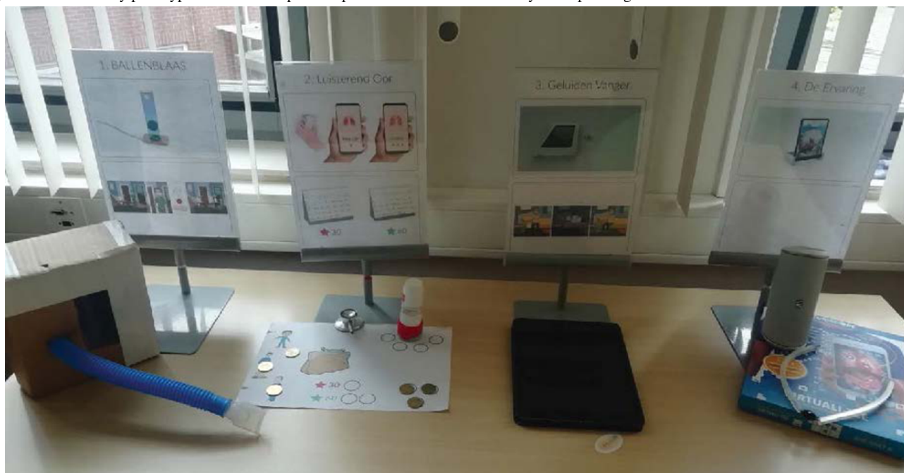
Figure 3. Low-fidelity prototypes and visual explainers positioned in an exhibition-style setup during the evaluation.

included were (1) a smart wheeze-detecting sensor to objectively monitor asthma state, (2) an immersive experience using augmented reality to engage the user in the monitoring process, (3) a playful spirometer, and (4) a wake-up experience, displaying the result of nocturnal asthma symptoms. We translated the concepts into low-fidelity prototypes to explore their feasibility and facilitate the upcoming feedback session with the participants. The prototypes consisted of cardboard mock-ups, physical artifacts, and off-the-shelf products, such as an augmented reality T-shirt with a projection of the lungs (Figure 3).