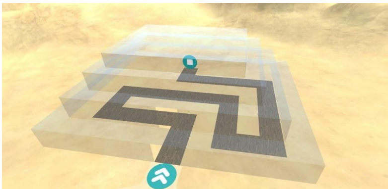
Fig 5.2 Design of the corridor with sharp turns used in the movement control task. The corridors inside the building are made up of 8, 90 degree turns. The blue icon with arrows indicates the entrance of the building. The blue icon with the square indicates the end location of the task.

Keyboard controlled movement was performed by pressing the four arrow keys on the keyboard. “Up” corresponded to forward movement, “down” corresponded to backward