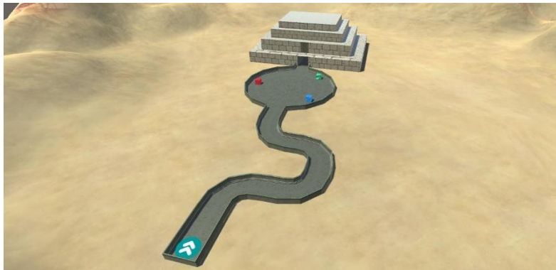
Fig 5.1 Design of the environment used in the movement control task. The environment can be subdivided in a meandering part, a circular area and a building featuring sharp turns. A mirrored version was created to accommodate for the two conditions.

road and the end-location was placed at the end of the corridor inside the building. Following the one-way road lead to the end-location as no junction points or crossroads were present. A geometrically mirrored version of environment was created to facilitate comparable environments for the two movement conditions.