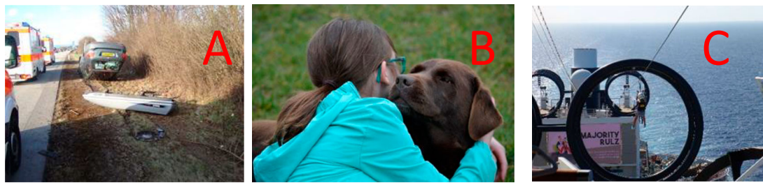
Figure 2. Selection of pictures that were used during the 3MDR exposure sessions. (A): A car accident. Negative label: ‘The memory does not go away; I don’t know everything I want to know to process my memory; the perpetrator disappears, so I can not process.’ Positive label: ‘I can tell some of the details I can remember now; It feels like I survived; it belongs to the past; I can live my life; This memory is a part of my story, I close this part of my book, and I will read it when I want to read it, and I will no longer be overwhelmed with flashbacks.’ (B) Depressive times. Negative label: ‘Every evening I had suicidal thoughts; I can feel it again, the sadness, exhaustion, and tiredness; I did not fit in with my peers; I am secluded.’ Positive label: ‘The sun is also shining for me, and the darkness is in the past; I feel happy; I feel relaxation in my body; For the first time, I am optimistic about my future; I am a free girl, and I wish I light tread I walk on the treadmill; I can dream about the future.’ (C) Resilience. Positive label: ‘The shadow is the past; there is a place for me in the world; I feel space within myself for who I am; I can shine’.

worry about her mother as she preferred the focus to remain on herself.