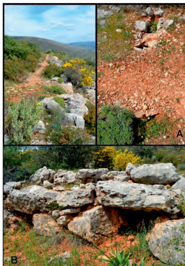
Figure 6. Section of Mycenaean road (highway 1, top left) with water management features of drainage channels (A) and multiple culverts (B).

SETinSTONE is funded by an ERC Consolidator Grant (Grant Agreement number 646777), and is based at the Faculty of Archaeology, Leiden University. We gladly