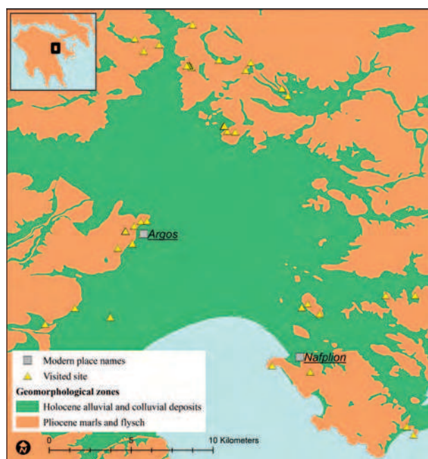
Figure 5. Research area for this sub-project. Indicated are the visited sites and geomorphological zones.

LBA. 28 Additionally, we also revisited several of the published stone quarries and published tombs, some located in the vicinity of potential stone extraction places and along roads. We photographed and described in detail the current state of all features and sites. Our information supplements the already published features, which were entered in our database. These are now grouped in categories and all located accurately on Google Maps to facilitate our analyses of their interrelationship in a 3D landscape, featuring sites, quarry locations and transport remains. Nodal points between areas of supply (agricultural products and building materials) and areas of construction and consumption are of specific interest. Our observations contribute towards a better understanding of how people and materials moved in the landscape for multiple reasons, many of which impacted on each other, while these road trajectories formed social and technical exchange hubs for skills, knowledge and resources.