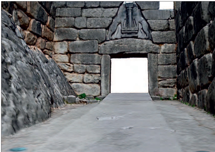
Figure 2. A section of a preliminary photogrammetry model of the Lion Gate at Mycenae.

The Late Bronze Age (specifically LH IIIB) Athenian Acropolis circuit wall is the second case study examined within the SETinSTONE project's methodology. However, it is not preserved to the same degree as Mycenae's circuit wall. 17 At the Athens Acropolis, Mycenaean period walls