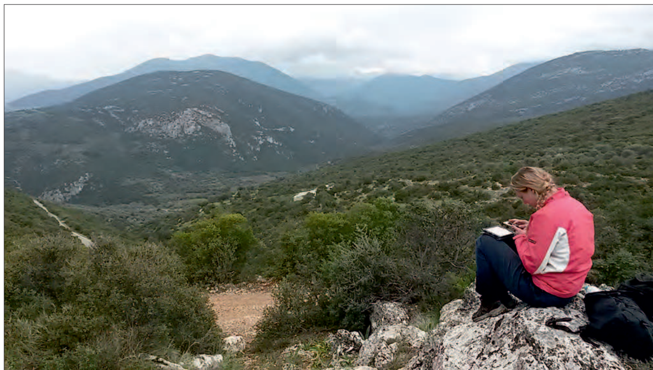
Figure 4. Recording landscape features in the area of Gimno, northwest Argive Plain.

The preliminary results of the literature study into subsistence strategies have revealed that existing notions about land use practices and environmental constraints in the Argive plain should be re-evaluated. In particular, recent archaeobotanical studies have enriched the knowledge on the versatility of plant species cultivated in LBA Greece. 22 Furthermore, new evidence suggests that the Eastern Mediterranean climate changed towards cooler and more arid conditions during the final years of the Bronze Age. 23 This may have caused dramatic fluctuations in crop production, and eventually could have led to socio-political changes. Clearly, reconstructing LBA land use and subsistence should be approached holistically, incorporating the very recent data received from material evidence and scientific methods. This way it is possible to complete an overall picture of this region at the end of the LBA.