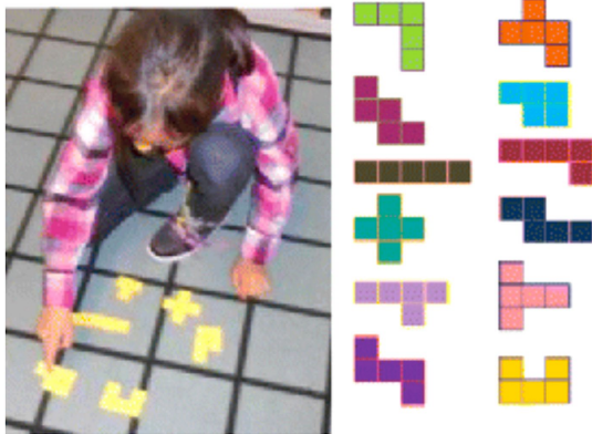
FIGURE 2 Example of a hands-on activity requiring visualization and mental rotation skills within a spatialized math curriculum (Hawes et al., 2017). Reprinted with permission.

but also showed transfer to STEM learning, such as mathematics. However, research examining transfer of spatial interventions to performance in STEM subjects is still relatively new (Hawes et al., 2022). As a majority of the research on transfer has been centered around the transfer to mathematics, transfer from spatial interventions to performance in other STEM subjects, such as science, engineering, and technology, warrants further investigation (Uttal and Cohen, 2012; Stieff and Uttal, 2015; Margulieux, 2020).