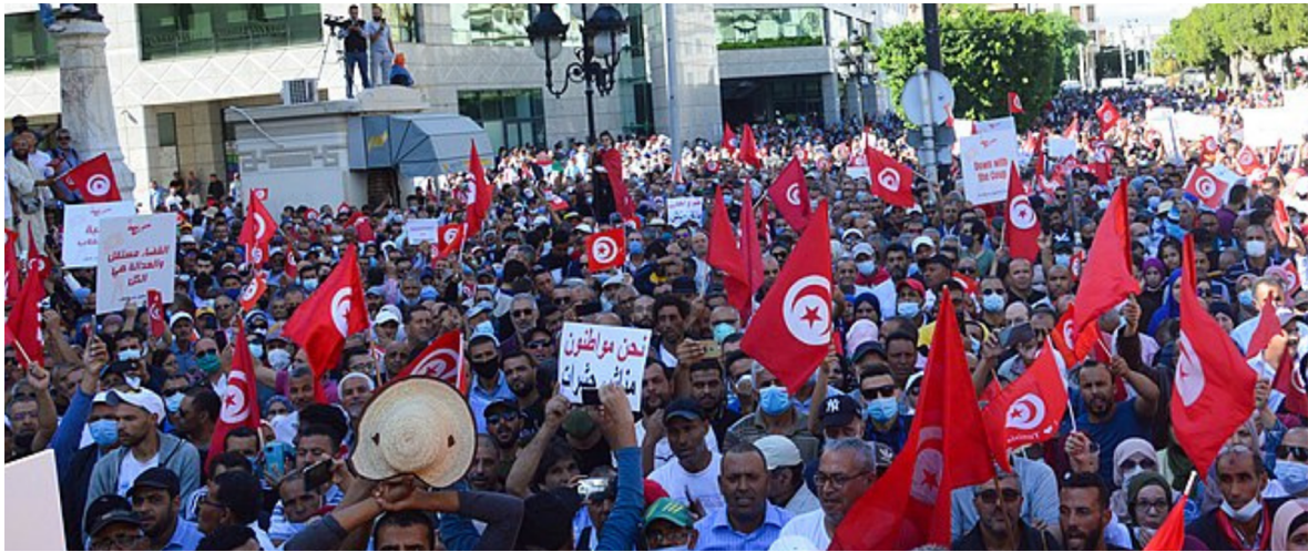
Demonstrators in Tunis protest against the coup enacted by Kais Saied, 10 October 2021

It would be tempting to explain the xenophobic outburst in Tunisian politics as a side-effect of the regime's autocratic turn . In July 2021, Saied dissolved Parliament, pushed through a new constitution and arrested dozens of prominent opposition figures. But Tunisia's history shows that the dynamics between regime type and immigration politics are more complex.